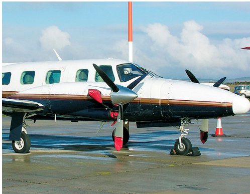
Piper Cheyenne IIXL Prop Tie/Exhaust Covers, Intake Plugs

Engine Inlet Plugs are custom fit for your Piper PA-31T: Cheyenne, Cheyenne II XL intakes, made with heavy-duty vinyl material, and stuffed with a single block of sculpted urethane foam. Each plug has a zipper that allows the foam to be removed and dried if necessary. Engine plugs have warning flags that are visible from the cockpit or 'remove before flight' streamers sewn onto the face of the plugs. Most plugs are imprinted with the aircraft registration number in black for an extra charge. Storage bag NOT included. Engine plugs may be inserted after flight when the engine is still warm. Engine Inlet Plugs are commonly referred to as Cowl Plugs, Intake Plugs, Cowl Blocks, Engine Blocks, and Engine Bungs.