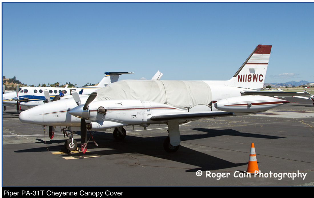
Piper PA-31T Cheyenne Canopy Cover