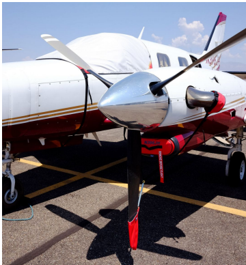
Piper Cheyenne Cockpit Cover, Engine Plugs, Prop Tie/Exhaust Covers

non-travel Sunbrella Cover is the best choice.