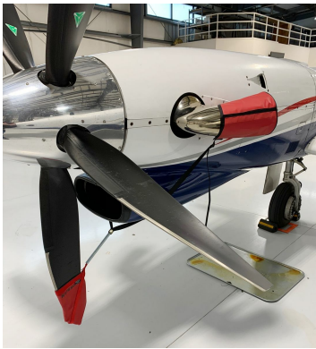
Piper PA-31T Cheyenne Intake Plugs, Prop Tie/Exhaust Covers Piper PA-31T Cheyenne II Prop Tie-Downs/Exhaust Covers