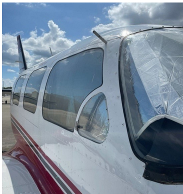
Piper PA-31 Models Cockpit HeatShields

for cockpit overheating, but an external fabric cover is more effective for long-term protection.