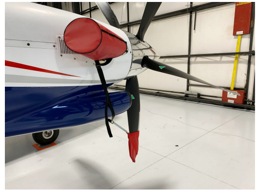
Piper Navajo Canopy, Extended Cockpit, Cockpit & Engine Covers Piper PA-31T Cheyenne II Prop Tie-Downs/Exhaust Covers