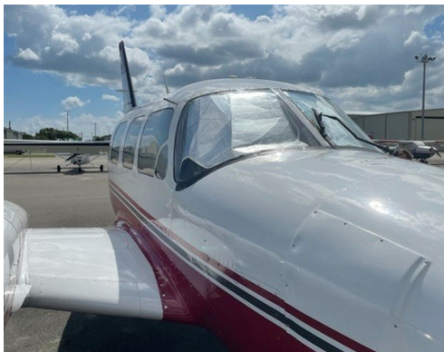
Piper PA-31 Models Cockpit HeatShields