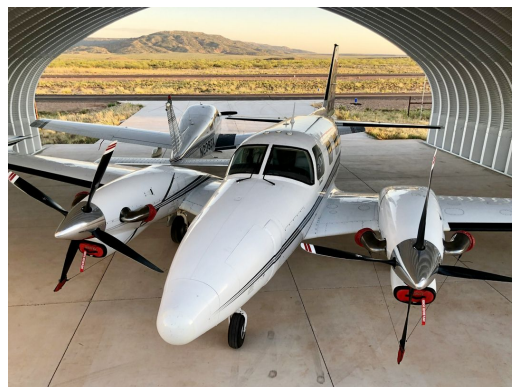
Piper PA-31T Cheyenne Intake Plugs, Prop Tie/Exhaust Covers