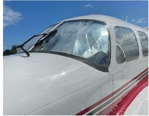
Piper PA-31 Models Cockpit HeatShields