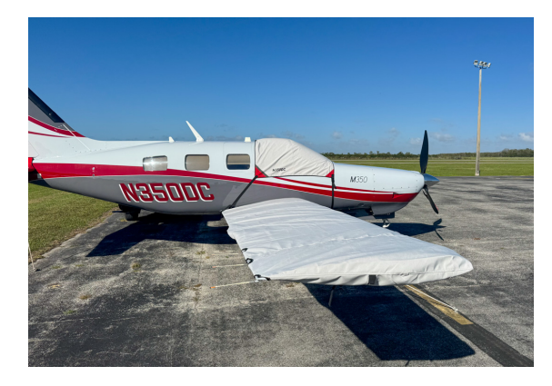
Piper PA 46-350P Cockpit & Wing Covers

This cover type is made from Silver Acrylic Sunbrella canvas and is 100% lined with a soft and smooth microfiber. Bruce's Custom Covers developed this material combination especially for aircraft protection. The outer material is medium weight and treated for water resistance, UV resistance and anti-static buildup. The inner lining is a very soft and smooth microfiber to prevent scratching. The material is very reflective, and tests show that the cabin interior temperature can be reduced to near-ambient temperature on the hottest of days. It is water, ice and snow repellent, yet breathable to allow moisture to escape from between the cover and the aircraft surface.