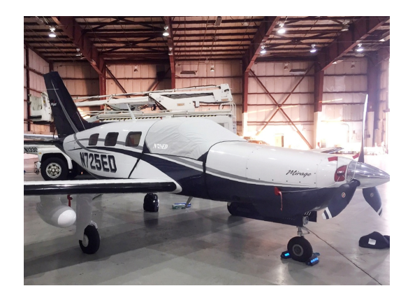
Piper Malibu/Mirage Cockpit Cover, Engine Plugs

Engine Inlet Plugs are custom fit for your Piper PA-46-350P Mirage, Matrix, JetProp intakes, made with heavy-duty vinyl material, and stuffed with a single block of sculpted urethane foam. Each plug has a zipper that allows the foam to be removed and dried if necessary. Engine plugs have warning flags that are visible from the cockpit or 'remove before flight' streamers sewn onto the face of the plugs. Most plugs are imprinted with the aircraft registration number in black for an extra charge. Storage bag NOT included. Engine plugs may be inserted after flight when the engine is still warm. Engine Inlet Plugs are commonly referred to as Cowl Plugs, Intake Plugs, Cowl Blocks, Engine Blocks, and Engine Bungs.