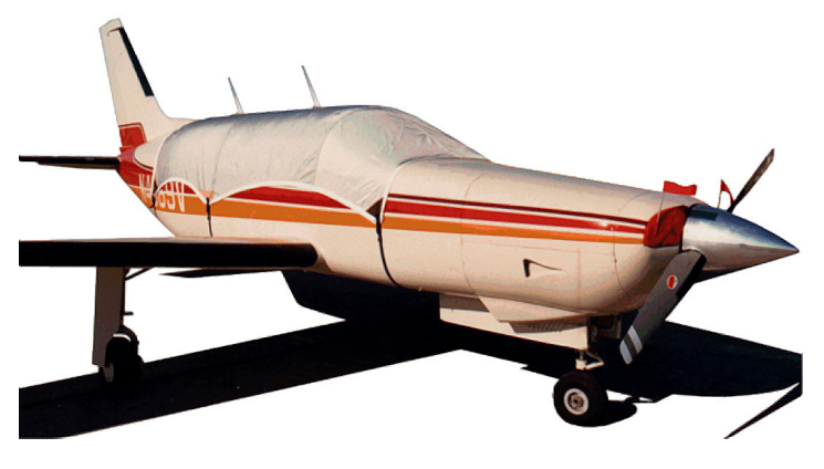
Piper Malibu/Mirage Standard Canopy Cover

Travel Covers are made with Silver Solution-Dyed Polyester fabric and only lined over the windshield to save weight. The material is lightweight and more compact for easy stowage in the aircraft. The polyester material is water resistant, but only intended for occasional use outside. We also have an ultra lightweight material available for fitted hangar dust covers. For daily outdoor use, the non-travel Sunbrella Cover is the best choice.