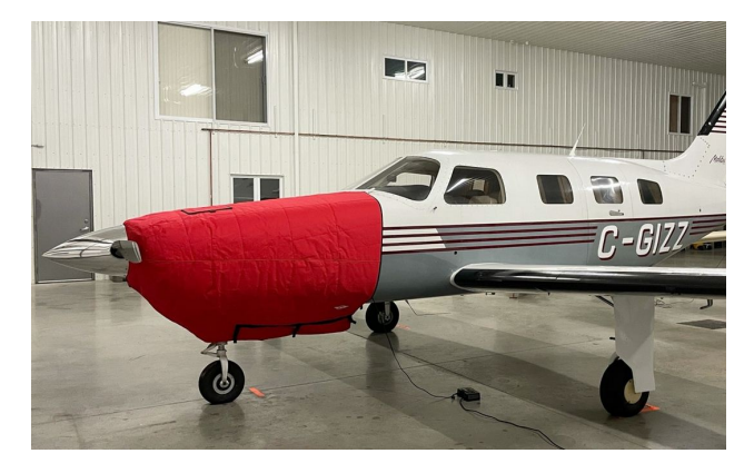
Malibu PA-46-310P Insulated Engine Cover

This cover type is made from Silver Acrylic Sunbrella canvas and is 100% lined with a soft and smooth microfiber. Bruce's Custom Covers developed this material combination especially for aircraft protection. The outer material is medium weight and treated for water resistance, UV resistance and anti-static buildup. The inner lining is a very soft and smooth microfiber to prevent scratching. The material is very reflective, and tests show that the cabin interior temperature can be reduced to near-ambient temperature on the hottest of days. It is water, ice and snow repellent, yet breathable to allow moisture to escape from between the cover and the aircraft surface.