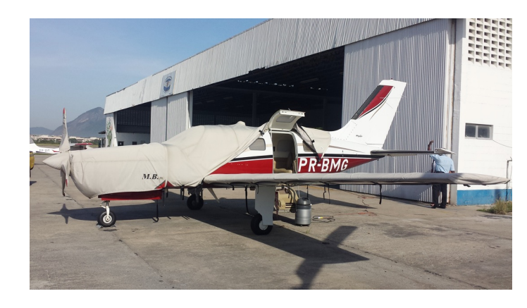
Piper Malibu/Mirage Extended Canopy Cover, Engine, Prop & Wing Covers