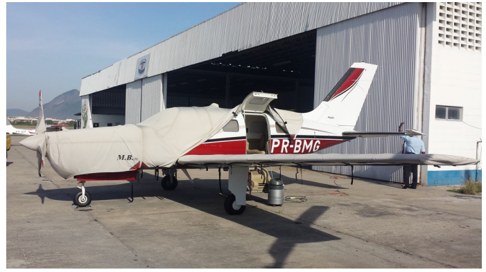
Piper Malibu/Mirage Extended Canopy Cover, Engine, Prop & Wing Covers