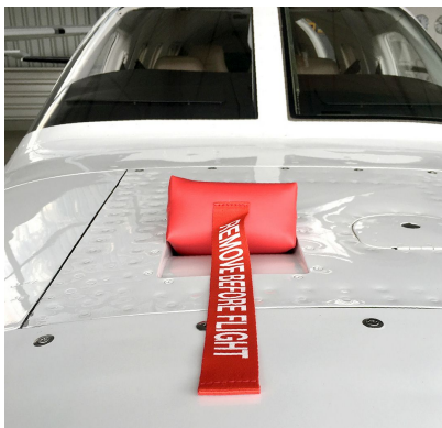
Piper PA-46-500TP Engine Cowl Top Plug (Generator Intake)

Engine Inlet Plugs are custom fit for your Piper PA-46-500TP, 600TP Meridian, M500, M600, M700 intakes, made with heavy-duty vinyl material, and stuffed with a single block of sculpted urethane foam. Each plug has a zipper that allows the foam to be removed and dried if necessary. Engine plugs have warning flags that are visible from the cockpit or 'remove before flight' streamers sewn onto the face of the plugs. Most plugs are imprinted with the aircraft registration number in black for an extra charge. Storage bag NOT included. Engine plugs may be inserted after flight when the engine is still warm. Engine Inlet Plugs are commonly referred to as Cowl Plugs, Intake Plugs, Cowl Blocks, Engine Blocks, and Engine Bungs.