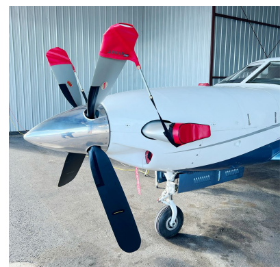
Piper Meridian Prop Tie/Exhaust Cover