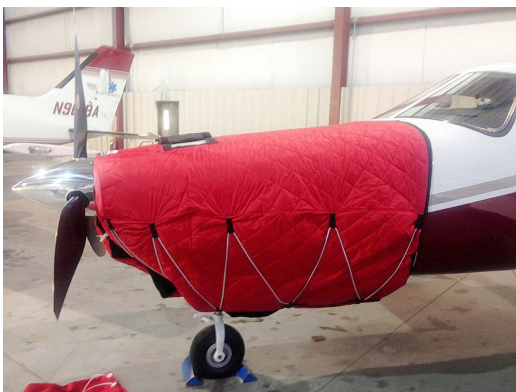
Piper PA-46 Insulated Engine Cover, fully enclosed with oil door flap