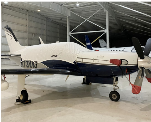
PA-46-500TP Canopy Cover

This cover type is made from Silver Acrylic Sunbrella canvas and is 100% lined with a soft and smooth microfiber. Bruce's Custom Covers developed this material combination especially for aircraft protection. The outer material is medium weight and treated for water resistance, UV resistance and anti-static buildup. The inner lining is a very soft and smooth microfiber to prevent scratching. The material is very reflective, and tests show that the cabin interior temperature can be reduced to near-ambient temperature on the hottest of days. It is water, ice and snow repellent, yet breathable to allow moisture to escape from between the cover and the aircraft surface.