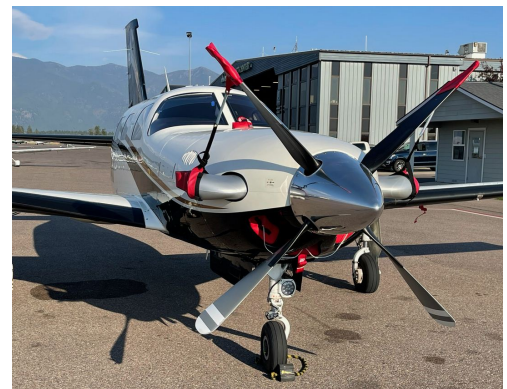
Piper Meridian Prop Tie/Exhaust Cover, Plug Set