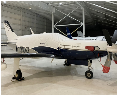
PA-46-500TP Canopy Cover

This cover type is made from Silver Acrylic Sunbrella canvas and is 100% lined with a soft and smooth microfiber. Bruce's Custom Covers developed this material combination especially for aircraft protection. The outer material is medium weight and treated for water resistance, UV resistance and anti-static buildup. The inner lining is a very soft and smooth microfiber to prevent scratching. The material is very reflective, and tests show that the cabin interior temperature can be reduced to near-ambient temperature on the hottest of days. It is water, ice and snow repellent, yet breathable to allow moisture to escape from between the cover and the aircraft surface.