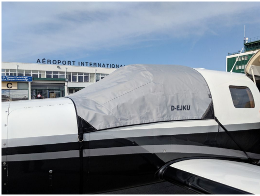
Piper PA46-350P Malibu Mirage Travel Cockpit Cover