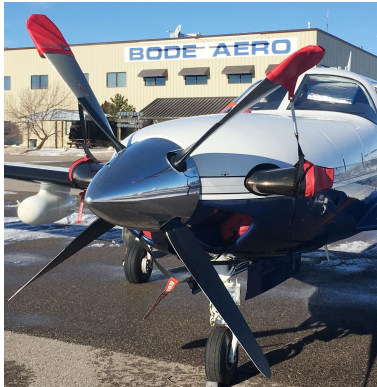
Piper PA46TP-500 Meridian Prop Tie/Exhaust Covers, Engine Plugs

Engine Inlet Plugs are custom fit for your Piper PA-46-500TP, 600TP Meridian, M500, M600, M700 intakes, made with heavy-duty vinyl material, and stuffed with a single block of sculpted urethane foam. Each plug has a zipper that allows the foam to be removed and dried if necessary. Engine plugs have warning flags that are visible from the cockpit or 'remove before flight' streamers sewn onto the face of the plugs. Most plugs are imprinted with the aircraft registration number in black for an extra charge. Storage bag NOT included. Engine plugs may be inserted after flight when the engine is still warm. Engine Inlet Plugs are commonly referred to as Cowl Plugs, Intake Plugs, Cowl Blocks, Engine Blocks, and Engine Bungs.