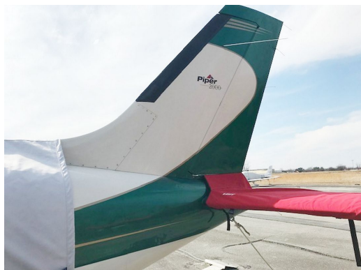
Piper Malibu/Mirage Horizontal Stabilizer/Tailcone Cover

shorter useful life if used continuously outside than the all-year use material.