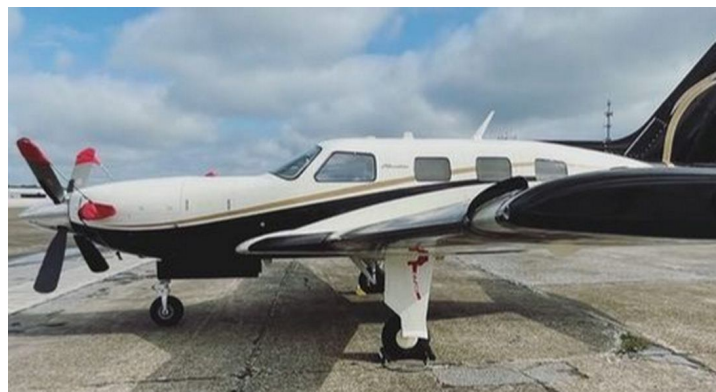
Piper PA-46-500TP prop tie/exhaust cover set

This cover type is made from Silver Acrylic Sunbrella canvas and is 100% lined with a soft and smooth microfiber. Bruce's Custom Covers developed this material combination especially for aircraft protection. The outer material is medium weight and treated for water resistance, UV resistance and anti-static buildup. The inner lining is a very soft and smooth microfiber to prevent scratching. The material is very reflective, and tests show that the cabin interior temperature can be reduced to near-ambient temperature on the hottest of days. It is water, ice and snow repellent, yet breathable to allow moisture to escape from between the cover and the aircraft surface.