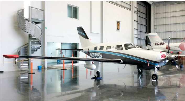
Piper PA-46 Malibu Wingtip Pads

Designed to prevent damage to the aircraft extremities in crowded hangars, these products are made of bright red Naugahyde and thickly padded with a sandwich of closed cell foam.