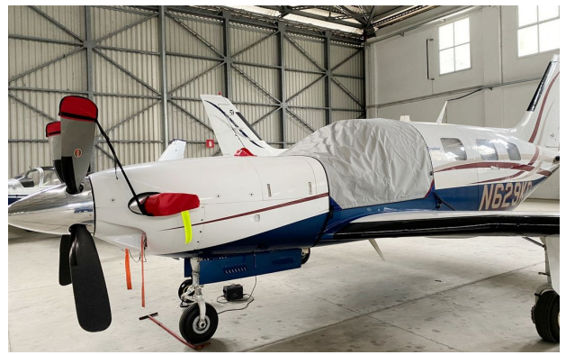
Piper PA-46-500TP Engine Cowling Top Plug