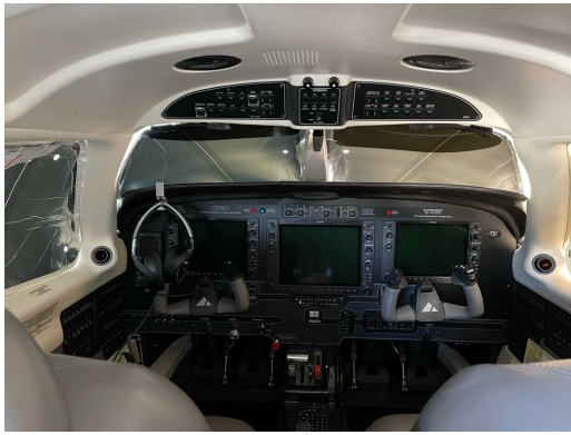
Piper Meridian Cockpit Sunshades