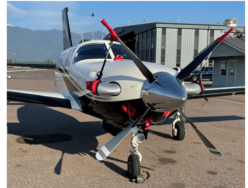
Piper Meridian Prop Tie/Exhaust Cover, Plug Set