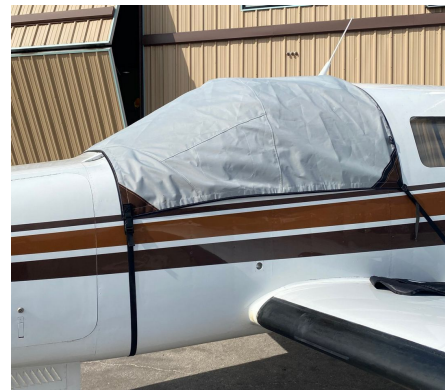
Piper PA46-310P Travel Weight Cockpit Cover