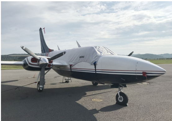
Smith Aerostar 600 Canopy Cover

The Piper PA-601 Aerostar Nose Cover is designed to cover the section of the fuselage forward of the windshield to the tip of the nose. It is secured with belly strapsThis cover type is made from Silver Acrylic Sunbrella canvas and is 100% lined with a soft and smooth microfiber. Bruce's Custom Covers developed this material combination especially for aircraft protection. The outer material is medium weight and treated for water resistance, UV resistance and anti-static buildup. The inner lining is a very soft and smooth microfiber to prevent scratching. The material is very reflective, and tests show that the cabin interior temperature can be reduced to near-ambient temperature on the hottest of days. It is water, ice and snow repellent, yet breathable to allow moisture to escape from between the cover and the aircraft surface.