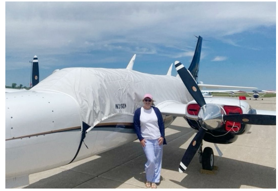
Piper PA-601 Aerostar