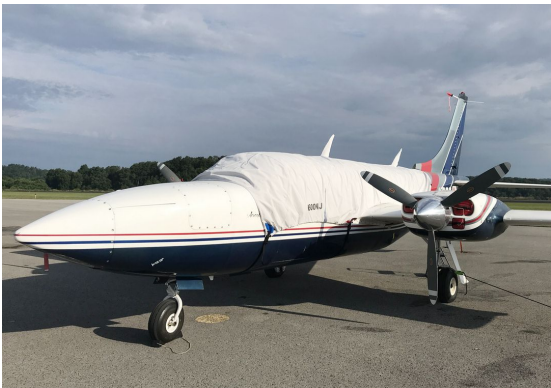
Smith Aerostar 600 Canopy Cover