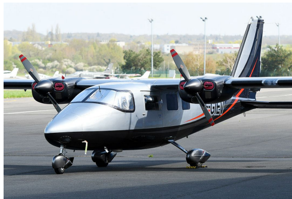
Partenavia P68c Cockpit HeatShields, Engine Plugs

Heatshields are interior sunshades for an aircraft's windows or canopy glass. The product is a unique composite of closed-cell foam with a silver mylar finish. The semi-rigid design is stiff enough to stand along the inside of the windshield using sun visors or window framing. It folds up flat and easily stores in the included storage sleeve. Some designs may require velcro and suction cups. A Heatshield is an excellent short-term remedy for cockpit overheating.