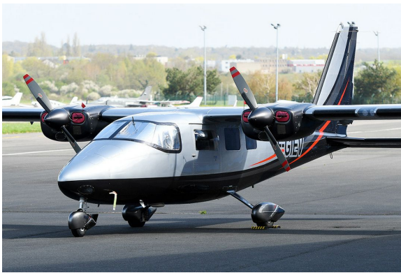
Partenavia P68c Cockpit HeatShields, Engine Plugs