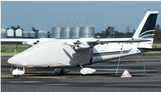
Partenavia P-68C Canopy Cover