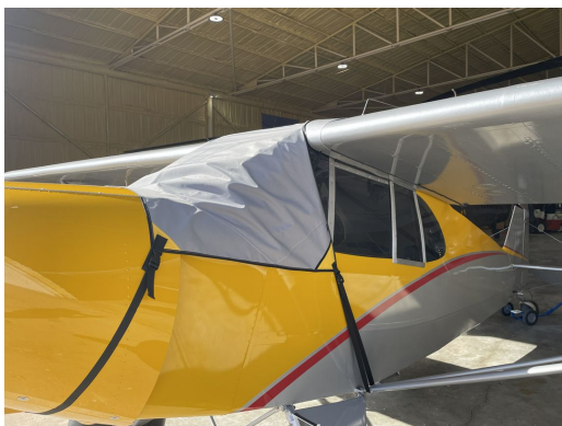
Piper PA-18 Windshield/Skylight Cover

This cover type is made from Silver Acrylic Sunbrella canvas and is 100% lined with a soft and smooth microfiber. Bruce's Custom Covers developed this material combination especially for aircraft protection. The outer material is medium weight and treated for water resistance, UV resistance and anti-static buildup. The inner lining is a very soft and smooth microfiber to prevent scratching. The material is very reflective, and tests show that the cabin interior temperature can be reduced to near-ambient temperature on the hottest of days. It is water, ice and snow repellent, yet breathable to allow moisture to escape from between the cover and the aircraft surface.