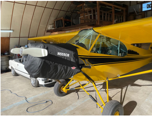
Piper PA-11 Replica Insulated Engine Cover