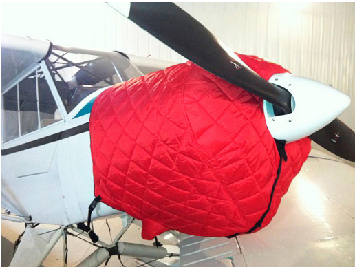
Piper Super Cub Insulated Engine Cover

Engine Inlet Plugs are custom fit for your Piper PA-11 Cub Special intakes, made with heavy-duty vinyl material, and stuffed with a single block of sculpted urethane foam. Each plug has a zipper that allows the foam to be removed and dried if necessary. Engine plugs have warning flags that are visible from the cockpit or 'remove before flight' streamers sewn onto the face of the plugs. Most plugs are imprinted with the aircraft registration number in black for an extra charge. Storage bag NOT included. Engine plugs may be inserted after flight when the engine is still warm. Engine Inlet Plugs are commonly referred to as Cowl Plugs, Intake Plugs, Cowl Blocks, Engine Blocks, and Engine Bungs.