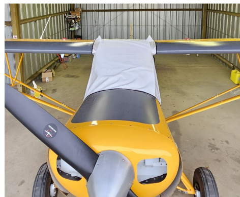
Piper PA-12: Super Cruiser, J5 Cub Windshield/Skylight Cover