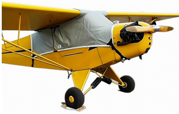
Piper J3 Canopy Cover