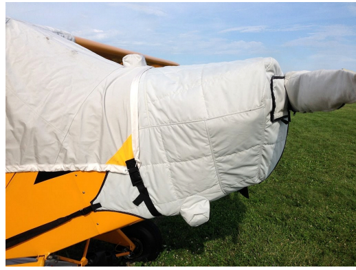
Piper J-3 Cub Insulated Engine Cover with added Pre-heater Access Flaps