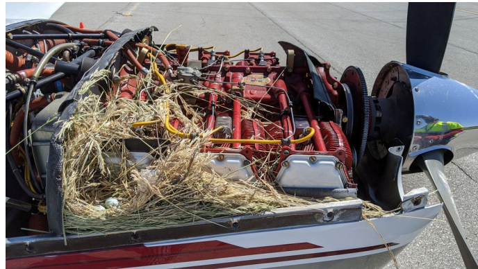
ENGINE PLUGS PREVENT BIRD NEST FOD. Piper Saratoga Engine Cowling Bird's Nest