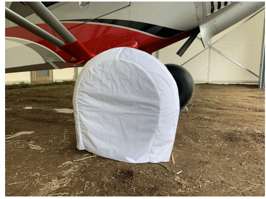
Cub Crafters CC19 Oversize Tire Covers, test fit cover