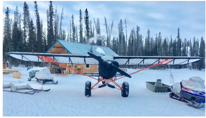
Piper PA-18 Super Cub Canopy Cover (Over-The-Top Style)