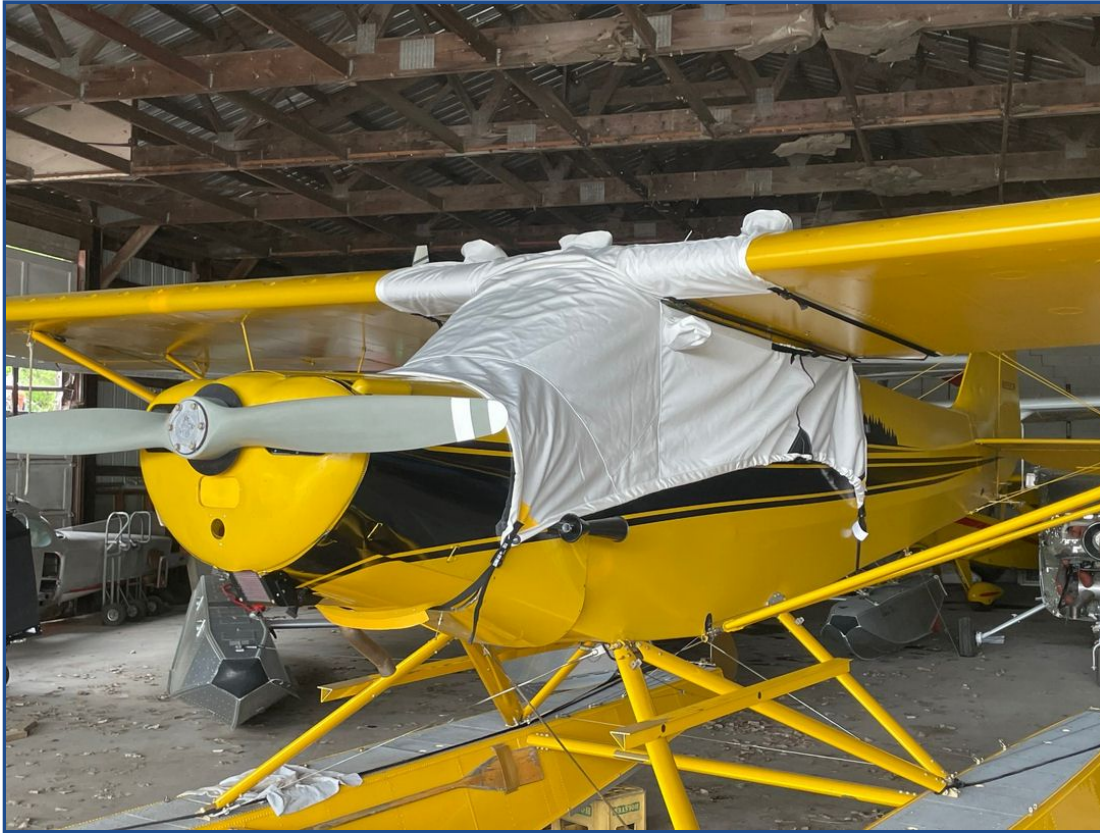
Piper PA-11 Over-Top Canopy Cover, extends to cover gas caps