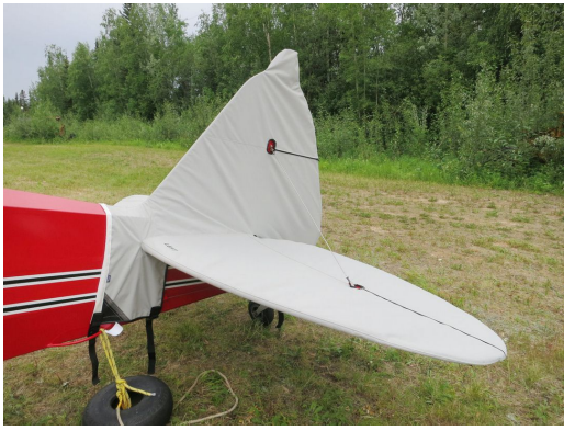
Piper PA-12 Abbreviated Empennage Cover