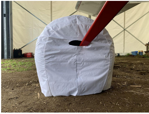
Cub Crafters CC19 Oversize Tire Covers, test fit cover