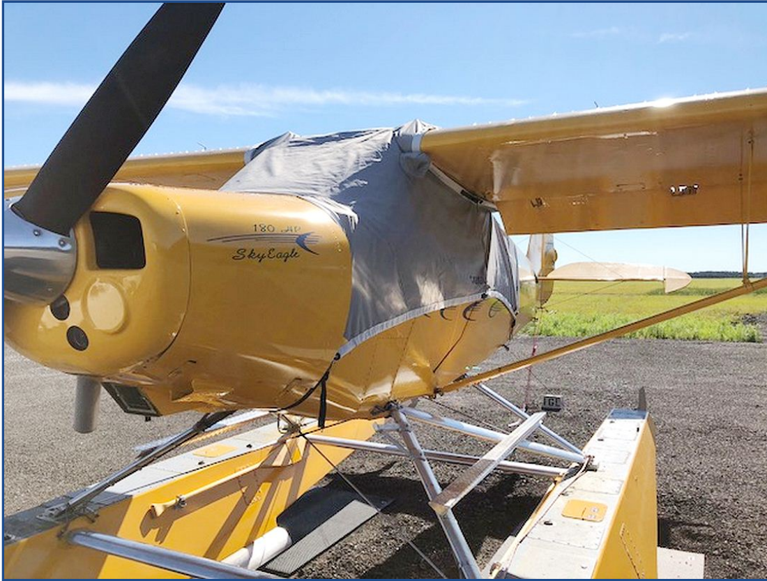
Sportsman 2+2 Wag Aero Light Weight Over the Top Travel Canopy Cover