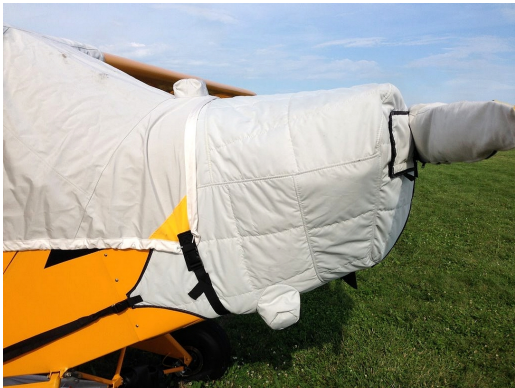
Piper J-3 Cub Insulated Engine Cover with added Pre-heater Access Flaps

This cover type is made from Silver Acrylic Sunbrella canvas and is 100% lined with a soft and smooth microfiber. Bruce's Custom Covers developed this material combination especially for aircraft protection. The outer material is medium weight and treated for water resistance, UV resistance and anti-static buildup. The inner lining is a very soft and smooth microfiber to prevent scratching. The material is very reflective, and tests show that the cabin interior temperature can be reduced to near-ambient temperature on the hottest of days. It is water, ice and snow repellent, yet breathable to allow moisture to escape from between the cover and the aircraft surface.