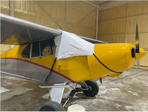
Piper J5A Windshield/Skylight Cover, test fit

This cover type is made from Silver Acrylic Sunbrella canvas and is 100% lined with a soft and smooth microfiber. Bruce's Custom Covers developed this material combination especially for aircraft protection. The outer material is medium weight and treated for water resistance, UV resistance and anti-static buildup. The inner lining is a very soft and smooth microfiber to prevent scratching. The material is very reflective, and tests show that the cabin interior temperature can be reduced to near-ambient temperature on the hottest of days. It is water, ice and snow repellent, yet breathable to allow moisture to escape from between the cover and the aircraft surface.