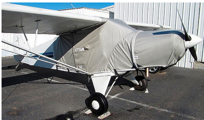
Piper PA-11 Replica Insulated Engine Cover Piper PA-12 Super Cruiser Extended Over-the-Top Canopy Cover & Engine Cover