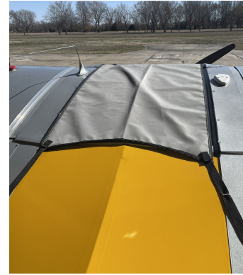
Piper PA-18 Windshield/Skylight Cover