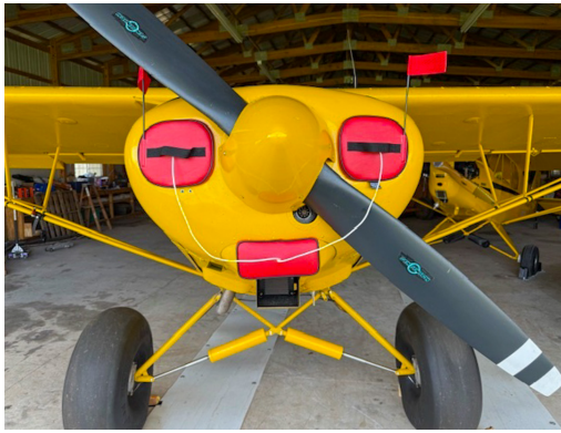
Piper PA-18-150 Engine Inlet Plugs (set of 3)