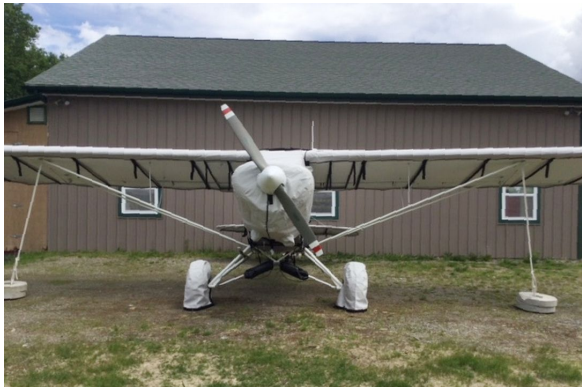
Piper PA-18-150 Super Cub Complete Cover Set