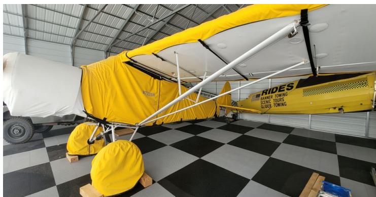
Piper PA-18 Complete Cover Set