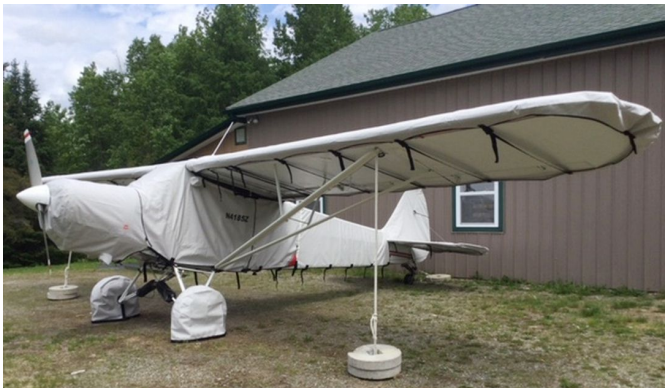
Piper PA-18-150 Super Cub Complete Cover Set