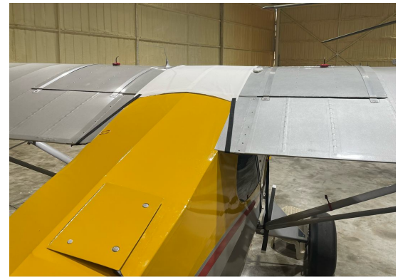
Piper J5A Windshield/Skylight Cover, test fit