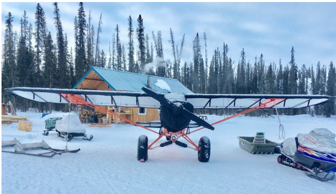
Piper PA-18 Super Cub Canopy Cover (Over-The-Top Style)

This cover type is made from Silver Acrylic Sunbrella canvas and is 100% lined with a soft and smooth microfiber. Bruce's Custom Covers developed this material combination especially for aircraft protection. The outer material is medium weight and treated for water resistance, UV resistance and anti-static buildup. The inner lining is a very soft and smooth microfiber to prevent scratching. The material is very reflective, and tests show that the cabin interior temperature can be reduced to near-ambient temperature on the hottest of days. It is water, ice and snow repellent, yet breathable to allow moisture to escape from between the cover and the aircraft surface.