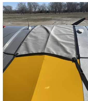
Piper PA-18 Windshield/Skylight Cover