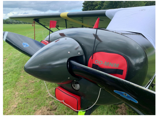
Piper PA-18 Super Cub Engine Plugs