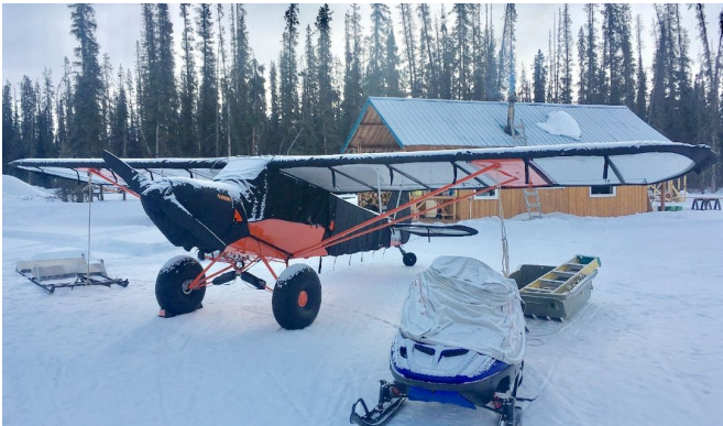
Piper PA-18 Super Cub Canopy Cover (Over-The-Top Style)