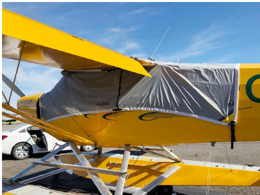
Sportsman 2+2 Wag Aero Light Weight Over the Top Travel Canopy Cover

This cover type is made from Silver Acrylic Sunbrella canvas and is 100% lined with a soft and smooth microfiber. Bruce's Custom Covers developed this material combination especially for aircraft protection. The outer material is medium weight and treated for water resistance, UV resistance and anti-static buildup. The inner lining is a very soft and smooth microfiber to prevent scratching. The material is very reflective, and tests show that the cabin interior temperature can be reduced to near-ambient temperature on the hottest of days. It is water, ice and snow repellent, yet breathable to allow moisture to escape from between the cover and the aircraft surface.