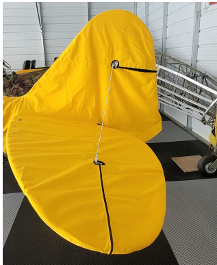
Piper PA-18 Empennage Cover

WINTER USE MATERIAL - Made with Solution-Dyed Polyester fabric, this option is intended for seasonal use to aid in deicing, rain mitigation, or for occasional travel. The material is lighter and more compact, but more susceptible to UV damage and may have a shorter useful life if used continuously outside than the all-year use material.