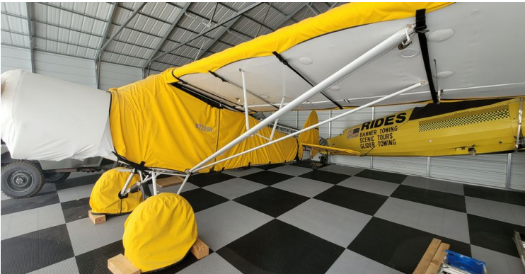
Piper PA-18 Complete Cover Set

ALL-YEAR USE MATERIAL - Made with Silver Acrylic Sunbrella canvas, the all-year use material is the best option for sun protection and cover longevity. This heavier more durable material is intended for all weather conditions, such as rain and snow or lots of sun.