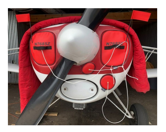
Piper PA-25 Pawnee Engine Plugs