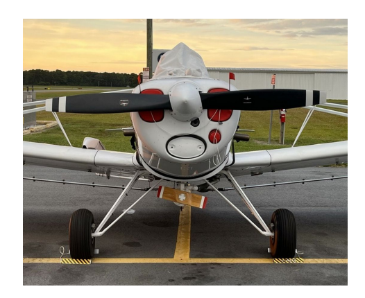
Piper PA-25 Pawnee Canopy/Hopper Cover

Engine Inlet Plugs are custom fit for your Piper Pawnee PA-25 intakes, made with heavy-duty vinyl material, and stuffed with a single block of sculpted urethane foam. Each plug has a zipper that allows the foam to be removed and dried if necessary. Engine plugs have warning flags that are visible from the cockpit or 'remove before flight' streamers sewn onto the face of the plugs. Most plugs are imprinted with the aircraft registration number in black for an extra charge. Storage bag NOT included. Engine plugs may be inserted after flight when the engine is still warm. Engine Inlet Plugs are commonly referred to as Cowl Plugs, Intake Plugs, Cowl Blocks, Engine Blocks, and Engine Bungs.