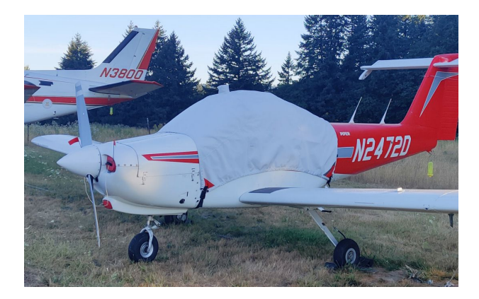
Piper PA-38 Tomahawk Canopy Cover

This cover type is made from Silver Acrylic Sunbrella canvas and is 100% lined with a soft and smooth microfiber. Bruce's Custom Covers developed this material combination especially for aircraft protection. The outer material is medium weight and treated for water resistance, UV resistance and anti-static buildup. The inner lining is a very soft and smooth microfiber to prevent scratching. The material is very reflective, and tests show that the cabin interior temperature can be reduced to near-ambient temperature on the hottest of days. It is water, ice and snow repellent, yet breathable to allow moisture to escape from between the cover and the aircraft surface.