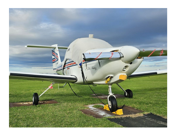
Piper PA-38 Tomahawk Canopy Cover