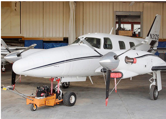
Piper Cheyenne IIXL Prop Tie/Exhaust Covers, Intake Plugs

This cover type is made from Silver Acrylic Sunbrella canvas and is 100% lined with a soft and smooth microfiber. Bruce's Custom Covers developed this material combination especially for aircraft protection. The outer material is medium weight and treated for water resistance, UV resistance and anti-static buildup. The inner lining is a very soft and smooth microfiber to prevent scratching. The material is very reflective, and tests show that the cabin interior temperature can be reduced to near-ambient temperature on the hottest of days. It is water, ice and snow repellent, yet breathable to allow moisture to escape from between the cover and the aircraft surface.