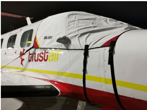
Piper PA-42 Cheyenne III Cockpit Cover