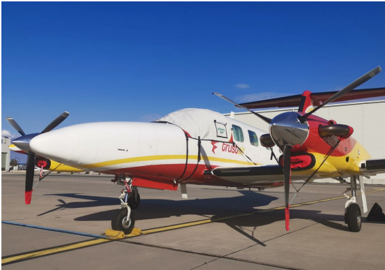
Piper PA-42 Cheyenne III Engine Plugs, Prop Ties, Cockpit Cover

Engine Inlet Plugs are custom fit for your Piper PA-42 Cheyenne III intakes, made with heavy-duty vinyl material, and stuffed with a single block of sculpted urethane foam. Each plug has a zipper that allows the foam to be removed and dried if necessary. Engine plugs have warning flags that are visible from the cockpit or 'remove before flight' streamers sewn onto the face of the plugs. Most plugs are imprinted with the aircraft registration number in black for an extra charge. Storage bag NOT included. Engine plugs may be inserted after flight when the engine is still warm. Engine Inlet Plugs are commonly referred to as Cowl Plugs, Intake Plugs, Cowl Blocks, Engine Blocks, and Engine Bungs.