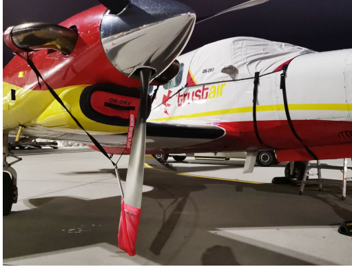
Piper PA-42 Cheyenne III Cockpit Cover, Prop Tie/Exhaust Cover, Inlet Plugs

Engine Inlet Plugs are custom fit for your Piper PA-42 Cheyenne III intakes, made with heavy-duty vinyl material, and stuffed with a single block of sculpted urethane foam. Each plug has a zipper that allows the foam to be removed and dried if necessary. Engine plugs have warning flags that are visible from the cockpit or 'remove before flight' streamers sewn onto the face of the plugs. Most plugs are imprinted with the aircraft registration number in black for an extra charge. Storage bag NOT included. Engine plugs may be inserted after flight when the engine is still warm. Engine Inlet Plugs are commonly referred to as Cowl Plugs, Intake Plugs, Cowl Blocks, Engine Blocks, and Engine Bungs.