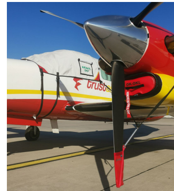
Piper Cheyenne IIXL Prop Tie/Exhaust Covers, Intake Plugs Piper PA-42 Cheyenne III Engine Plugs, Prop Ties, Cockpit Cover