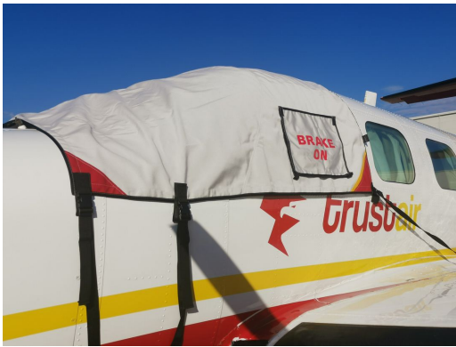
Piper PA-42 Cheyenne III Cockpit Cover

This cover type is made from Silver Acrylic Sunbrella canvas and is 100% lined with a soft and smooth microfiber. Bruce's Custom Covers developed this material combination especially for aircraft protection. The outer material is medium weight and treated for water resistance, UV resistance and anti-static buildup. The inner lining is a very soft and smooth microfiber to prevent scratching. The material is very reflective, and tests show that the cabin interior temperature can be reduced to near-ambient temperature on the hottest of days. It is water, ice and snow repellent, yet breathable to allow moisture to escape from between the cover and the aircraft surface.