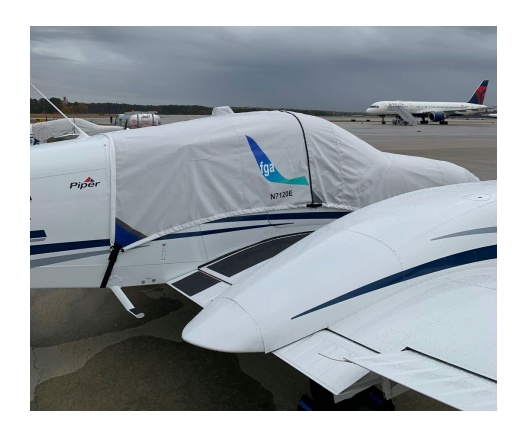
Piper PA-44 Seminole Canopy/Nose Cover with custom artwork