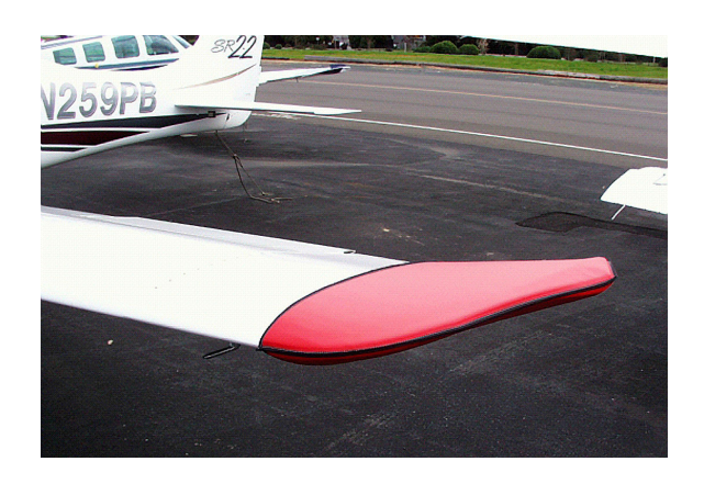
Cirrus SR-22 Wingtip Pad (also available for the Horiz. Stab.