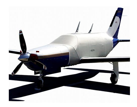
Piper Malibu/Mirage/Meridian Extended Canopy Cover