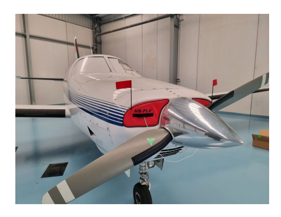
Piper PA-46 Malibu Engine Inlet Plugs

window framing. It folds up flat and easily stores in the included storage sleeve. Some designs may require velcro and suction cups. A Heatshield is an excellent short-term remedy for cockpit overheating.