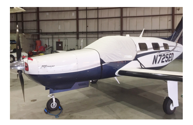
Piper Malibu/Mirage Cockpit Cover, Engine Plugs