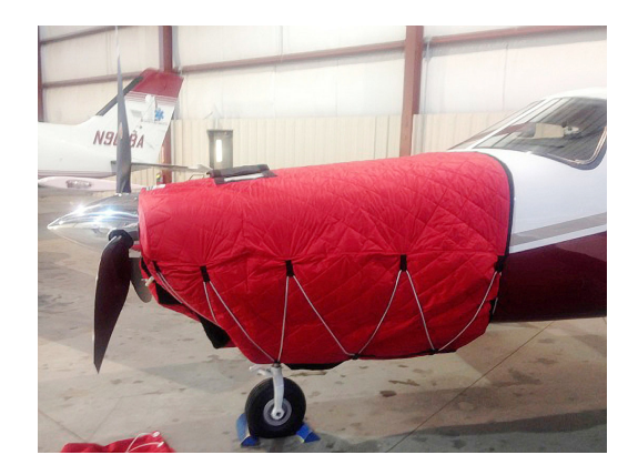
Piper PA-46 Insulated Engine Cover, fully enclosed with oil door flap

This cover type is made from Silver Acrylic Sunbrella canvas and is 100% lined with a soft and smooth microfiber. Bruce's Custom Covers developed this material combination especially for aircraft protection. The outer material is medium weight and treated for water resistance, UV resistance and anti-static buildup. The inner lining is a very soft and smooth microfiber to prevent scratching. The material is very reflective, and tests show that the cabin interior temperature can be reduced to near-ambient temperature on the hottest of days. It is water, ice and snow repellent, yet breathable to allow moisture to escape from between the cover and the aircraft surface.