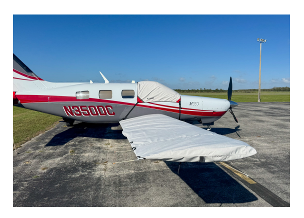
Piper PA 46-350P Cockpit & Wing Covers