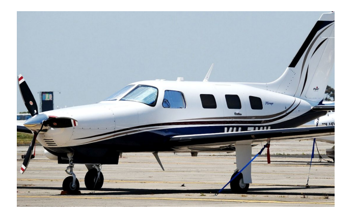
Piper PA-46-350P Mirage, Matrix, JetProp Cockpit Heatshields