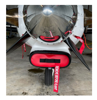
Piper Malibu JetProp Inlet Plugs