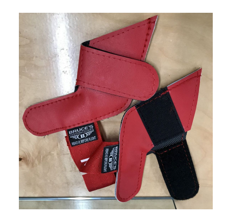
Piper PA-46-600TP M600 Pitot Covers, Heat Resistant Type, M600 Model Only