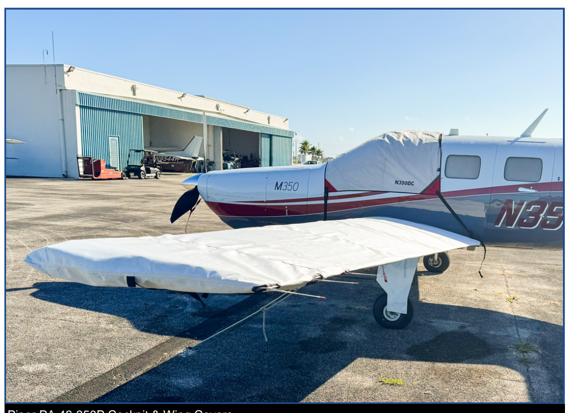
Piper PA 46-350P Cockpit & Wing Covers