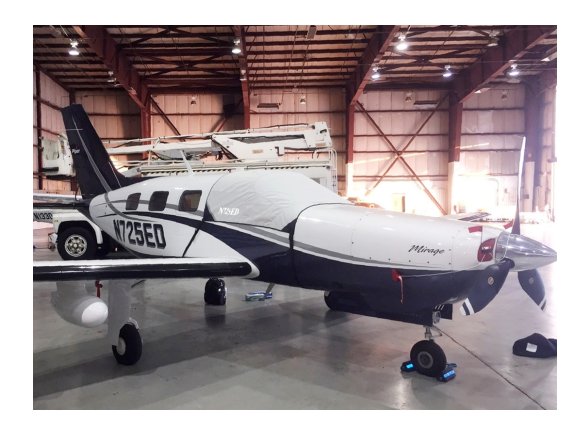
Piper Malibu/Mirage Cockpit Cover, Engine Plugs

This cover type is made from Silver Acrylic Sunbrella canvas and is 100% lined with a soft and smooth microfiber. Bruce's Custom Covers developed this material combination especially for aircraft protection. The outer material is medium weight and treated for water resistance, UV resistance and anti-static buildup. The inner lining is a very soft and smooth microfiber to prevent scratching. The material is very reflective, and tests show that the cabin interior temperature can be reduced to near-ambient temperature on the hottest of days. It is water, ice and snow repellent, yet breathable to allow moisture to escape from between the cover and the aircraft surface.