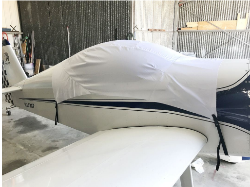
SPA, Sport Performance Aviation, Panther Canopy Cover (test fit cover)

This cover type is made from Silver Acrylic Sunbrella canvas and is 100% lined with a soft and smooth microfiber. Bruce's Custom Covers developed this material combination especially for aircraft protection. The outer material is medium weight and treated for water resistance, UV resistance and anti-static buildup. The inner lining is a very soft and smooth microfiber to prevent scratching. The material is very reflective, and tests show that the cabin interior temperature can be reduced to near-ambient temperature on the hottest of days. It is water, ice and snow repellent, yet breathable to allow moisture to escape from between the cover and the aircraft surface.