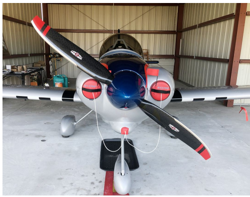
SPA Sport Panther Engine Inlet Plugs