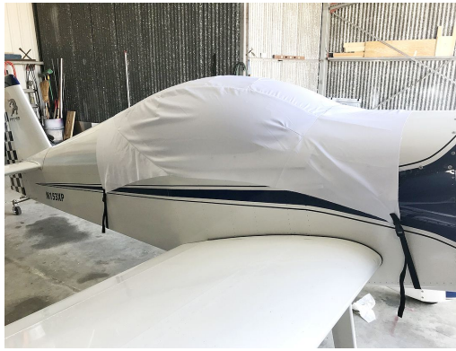
SPA, Sport Performance Aviation, Panther Canopy Cover (test fit cover)