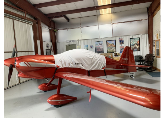
SPA Sport Panther Canopy Cover