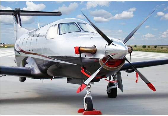
Pilatus PC-12 Engine Plugs, Prop Ties, Cockpit HeatShields