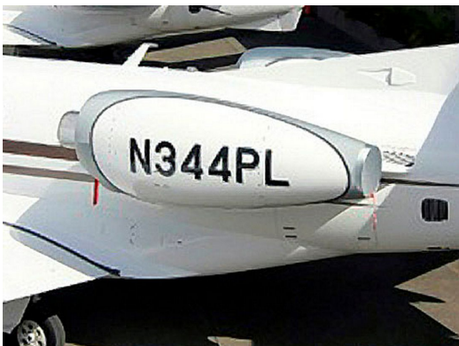
Phenom 300 "Bikini" type Engine Cover