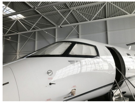
Pilatus PC-24 Cockpit HeatShields