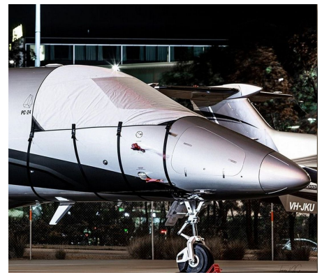
Pilatus PC-24 Cockpit Cover