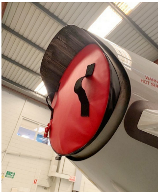
Pilatus PC-24 Engine Exhaust Plug