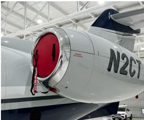
Pilatus PC-24 Engine Inlet Plugs

The Engine Inlet Plugs are custom fit for your Pilatus PC-24 intakes, made with heavy-duty vinyl material, and stuffed with a single block of sculpted urethane foam. Each plug has a zipper that allows the foam to be removed and dried if necessary. Engine plugs have 'remove before flight' streamers sewn onto the face of the plugs. Most plugs are imprinted with the aircraft registration number in black for an extra charge. Storage bag NOT included. Engine plugs may be inserted after flight when the engine is still warm. Engine Inlet Plugs are commonly referred to as Cowl Plugs, Intake Plugs, Cowl Blocks, Engine Blocks, and Engine Bungs.