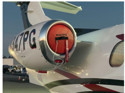
Embraer Phenom 100 Intake & Exhaust Plugs