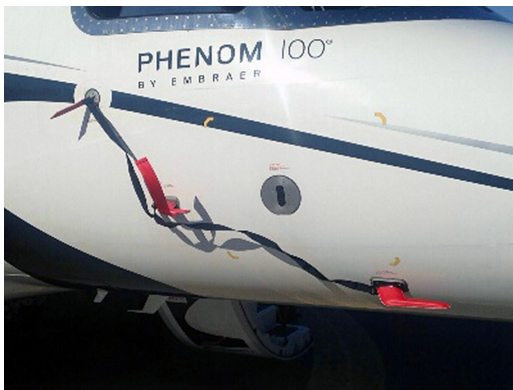
Embraer Phenom Pitot Cover/AOA Set, Heat Resistant Type

The Engine Inlet Plugs are custom fit for your Embraer Phenom 100 (EMB-500) intakes, made with heavy-duty vinyl material, and stuffed with a single block of sculpted urethane foam. Each plug has a zipper that allows the foam to be removed and dried if necessary. Engine plugs have 'remove before flight' streamers sewn onto the face of the plugs. Most plugs are imprinted with the aircraft registration number in black for an extra charge. Storage bag NOT included. Engine plugs may be inserted after flight when the engine is still warm. Engine Inlet Plugs are commonly referred to as Cowl Plugs, Intake Plugs, Cowl Blocks, Engine Blocks, and Engine Bungs.