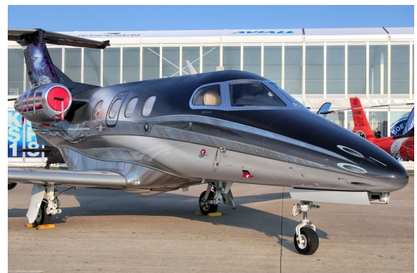
Phenom 100 Engine Inlet Plugs