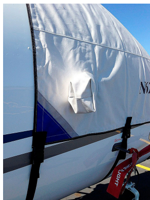
Phenom 100 EMB-500 Cockpit Cover (includes pockets over AOA vanes)

This cover type is made from Silver Acrylic Sunbrella canvas and is 100% lined with a soft and smooth microfiber. Bruce's Custom Covers developed this material combination especially for aircraft protection. The outer material is medium weight and treated for water resistance, UV resistance and anti-static buildup. The inner lining is a very soft and smooth microfiber to prevent scratching. The material is very reflective, and tests show that the cabin interior temperature can be reduced to near-ambient temperature on the hottest of days. It is water, ice and snow repellent, yet breathable to allow moisture to escape from between the cover and the aircraft surface.