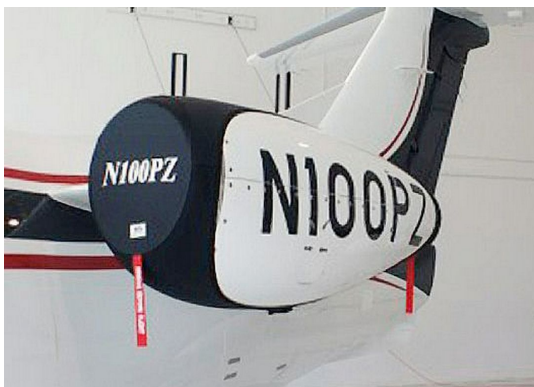
Phenom 100 "Bikini" Engine Covers

The Embraer Phenom 100 (EMB-500) Intake/Exhaust Plugs are custom fit for the intake and exhaust openings, made with heavy-duty vinyl material, and stuffed with a single block of sculpted urethane foam. Each plug has a zipper that allows the foam to be removed and dried if necessary. Engine plugs have 'remove before flight' streamers sewn onto the face of the plugs. Most plugs are imprinted with the aircraft registration number in black. Engine plugs may be inserted after flight when the engine is still warm. Engine Inlet Plugs are commonly referred to as Cowl Plugs, Intake Plugs, Cowl Blocks, Engine Blocks, and Engine Bungs.