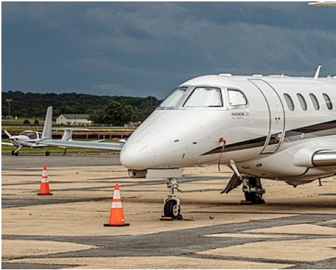
Embraer Phenom 100 Cockpit HeatShields

out because some aircraft manufacturers have issued advisories against reflective window inserts due to potential heat damage. A Heatshield is an excellent short-term remedy for cockpit overheating, but an external fabric cover is more effective for long-term protection.