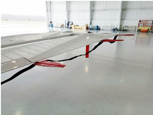
Hawker Beechcraft 800, 800XP, 850XP Static Wick Protectors