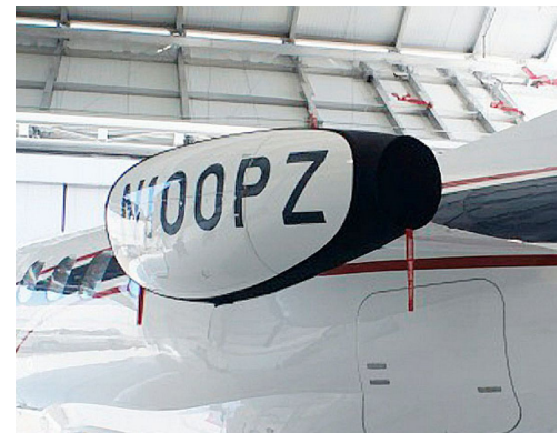
Phenom 100 "Bikini" Engine Covers