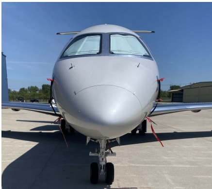
Embraer 505 Phenom 300 Cockpit HeatShields

Cockpit Heatshields are interior sunshades for the aircraft's cockpit. The product is a unique composite of closed-cell foam with a silver mylar finish. The semi-rigid design is stiff enough to stand inside the window framing. The set folds up flat and is easily stored in the included storage sleeve. Some designs may require velcro and suction cups. Our Heatshields for jets are offered white side out because some aircraft manufacturers have issued advisories against reflective window inserts due to potential heat damage. A Heatshield is an excellent short-term remedy for cockpit overheating, but an external fabric cover is more effective for long-term protection.