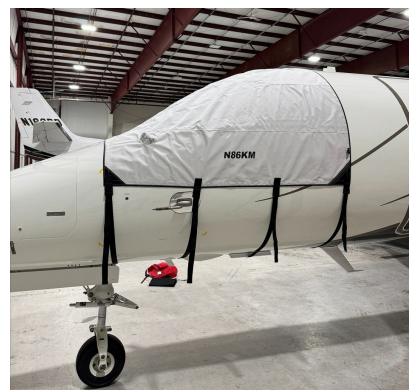
Phenom 300 Cockpit Cover