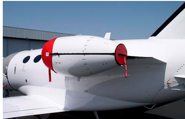
Cessna Mustang Intake/Exhaust Plug Set