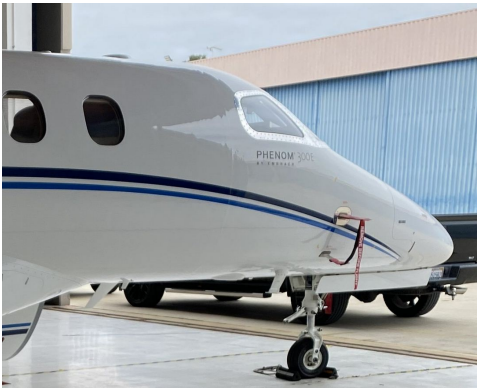
Embraer EMB-505 Pitot Cover Set