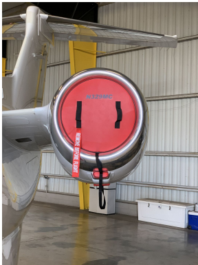
Embraer Phenom 300 Intake Plugs

The Engine Inlet Plugs are custom fit for your Embraer Phenom 300 (EMB-505) intakes, made with heavy-duty vinyl material, and stuffed with a single block of sculpted urethane foam. Each plug has a zipper that allows the foam to be removed and dried if necessary. Engine plugs have 'remove before flight' streamers sewn onto the face of the plugs. Most plugs are imprinted with the aircraft registration number in black for an extra charge. Storage bag NOT included. Engine plugs may be inserted after flight when the engine is still warm. Engine Inlet Plugs are commonly referred to as Cowl Plugs, Intake Plugs, Cowl Blocks, Engine Blocks, and Engine Bungs.