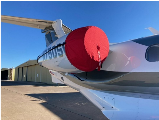
Embraer Phenom 300 (EMB-505) Engine Inlet Covers & Exhaust Plugs

The Embraer Phenom 300 (EMB-505) Intake/Exhaust Plugs are custom fit for the intake and exhaust openings, made with heavy-duty vinyl material, and stuffed with a single block of sculpted urethane foam. Each plug has a zipper that allows the foam to be removed and dried if necessary. Engine plugs have 'remove before flight' streamers sewn onto the face of the plugs. Most plugs are imprinted with the aircraft registration number in black. Engine plugs may be inserted after flight when the engine is still warm. Engine Inlet Plugs are commonly referred to as Cowl Plugs, Intake Plugs, Cowl Blocks, Engine Blocks, and Engine Bungs.