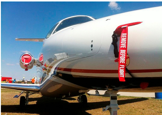
Hawker Beechcraft Premier 390 Intake Plug/Exhaust Plug Set Premier Heat Resistant Pitot Covers set & Engine Intake Plugs