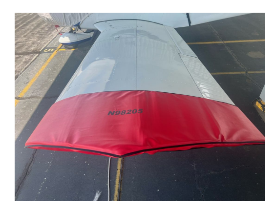
Piper PA-28-140 Wingtip Pads

Designed to prevent damage to the aircraft extremities in crowded hangars, these products are made of bright red Naugahyde and thickly padded with a sandwich of closed cell foam.