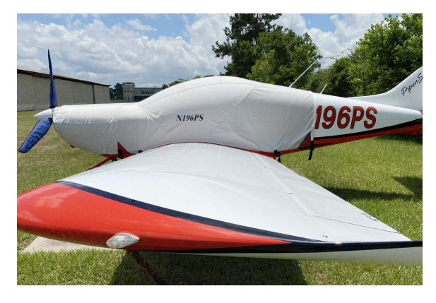
PiperSport Extended Canopy/Engine Cover

This cover type is made from Silver Acrylic Sunbrella canvas and is 100% lined with a soft and smooth microfiber. Bruce's Custom Covers developed this material combination especially for aircraft protection. The outer material is medium weight and treated for water resistance, UV resistance and anti-static buildup. The inner lining is a very soft and smooth microfiber to prevent scratching. The material is very reflective, and tests show that the cabin interior temperature can be reduced to near-ambient temperature on the hottest of days. It is water, ice and snow repellent, yet breathable to allow moisture to escape from between the cover and the aircraft surface.