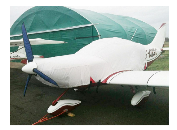
PiperSport Canopy/Engine Cover, Wing Locker Covers

WINTER USE MATERIAL - Made with Solution-Dyed Polyester fabric, this option is intended for seasonal use to aid in deicing, rain mitigation, or for occasional travel. The material is lighter and more compact, but more susceptible to UV damage and may have a shorter useful life if used continuously outside than the all-year use material.