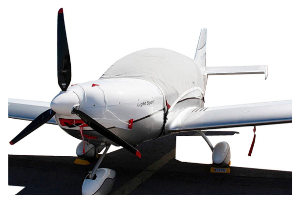
Sportcruiser Canopy Cover & Plugs