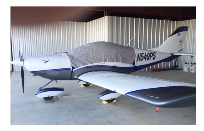
PiperSport Light Weight Travel Cover

Travel Covers are made with Silver Solution-Dyed Polyester fabric and only lined over the windshield to save weight. The material is lightweight and more compact for easy stowage in the aircraft. The polyester material is water resistant, but only intended for occasional use outside. We also have an ultra lightweight material available for fitted hangar dust covers. For daily outdoor use, the non-travel Sunbrella Cover is the best choice.