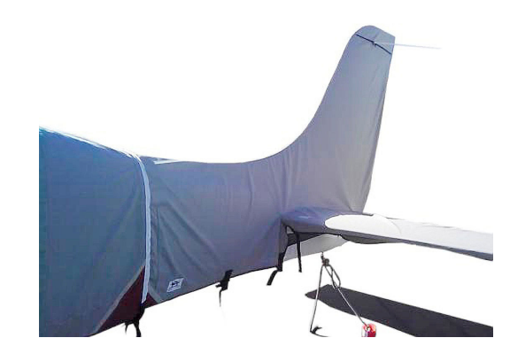
Cirrus SR20 Empennage Cover (covers tail boom, vertical and horizontal stabilizers)