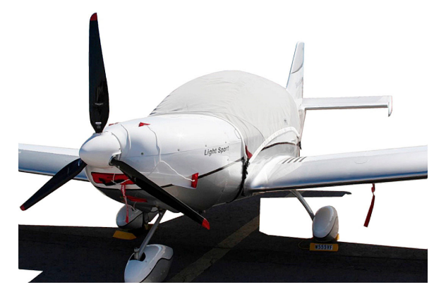
Sportcruiser Canopy Cover & Plugs

have warning flags that are visible from the cockpit or 'remove before flight' streamers sewn onto the face of the plugs. Most plugs are imprinted with the aircraft registration number in black for an extra charge. Storage bag NOT included. Engine plugs may be inserted after flight when the engine is still warm. Engine Inlet Plugs are commonly referred to as Cowl Plugs, Intake Plugs, Cowl Blocks, Engine Blocks, and Engine Bungs.