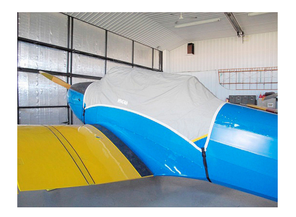
Fairchild PT-26 Canopy Cover