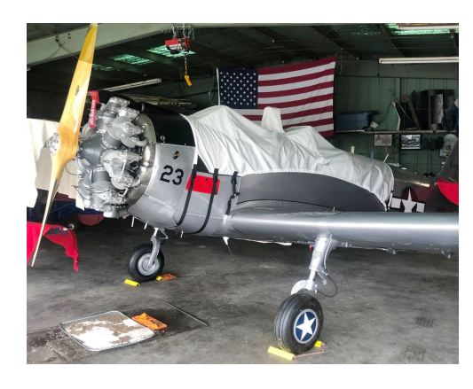
Fairchild PT-23 Canopy Cover