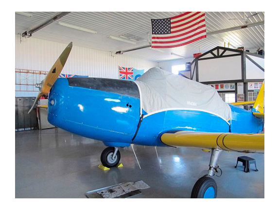
Fairchild PT-26 Canopy Cover

Travel Covers are made with Silver Solution-Dyed Polyester fabric and only lined over the windshield to save weight. The material is lightweight and more compact for easy stowage in the aircraft. The polyester material is water resistant, but only intended for occasional use outside. We also have an ultra lightweight material available for fitted hangar dust covers. For daily outdoor use, the non-travel Sunbrella Cover is the best choice.