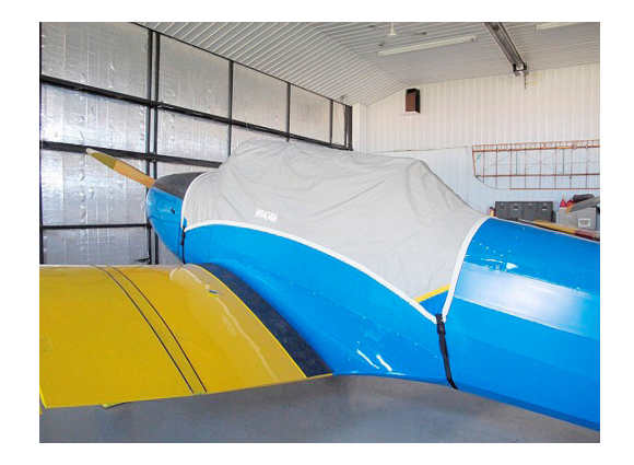
Fairchild PT-26 Canopy Cover