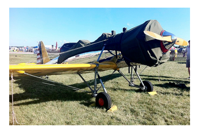
Ryan PT-22 Canopy Cover and Engine Cover