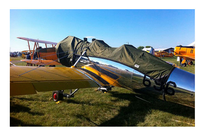
Ryan PT-22 Canopy Cover and Engine Cover