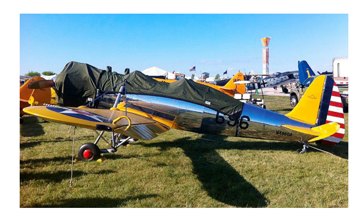
Ryan PT-22 ST3KR Canopy Cover and Engine Cover

water resistance, UV resistance and anti-static buildup. The inner lining is a very soft and smooth microfiber to prevent scratching. The material is very reflective, and tests show that the cabin interior temperature can be reduced to near-ambient temperature on the hottest of days. It is water, ice and snow repellent, yet breathable to allow moisture to escape from between the cover and the aircraft surface.