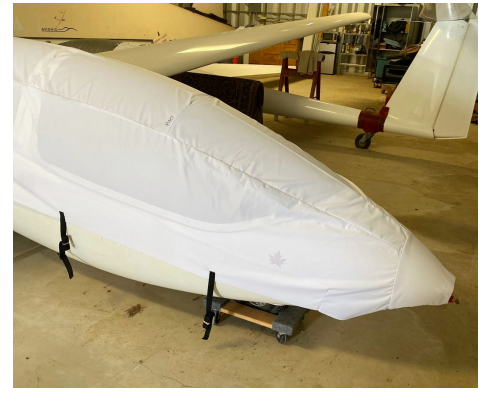
PZL Swidnik PW6 Canopy/Nose Cover