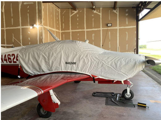
Rockwell Aero Commander Extended Canopy/Engine Cover

This cover type is made from Silver Acrylic Sunbrella canvas and is 100% lined with a soft and smooth microfiber. Bruce's Custom Covers developed this material combination especially for aircraft protection. The outer material is medium weight and treated for water resistance, UV resistance and anti-static buildup. The inner lining is a very soft and smooth microfiber to prevent scratching. The material is very reflective, and tests show that the cabin interior temperature can be reduced to near-ambient temperature on the hottest of days. It is water, ice and snow repellent, yet breathable to allow moisture to escape from between the cover and the aircraft surface.