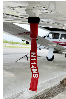
Blade-type Pitot Cover