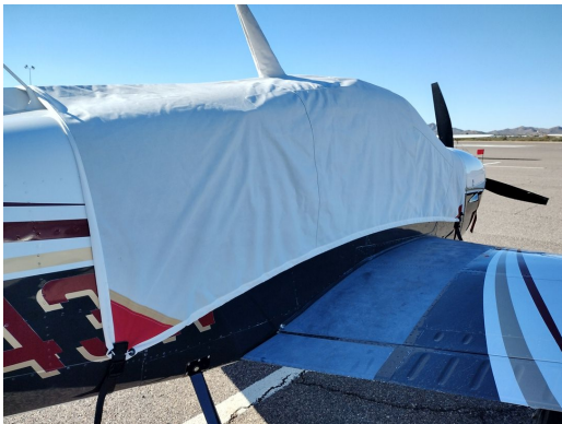
Rockwell Aero Commander 114 Canopy Cover