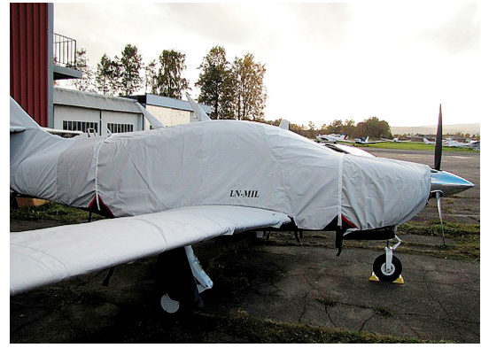
Rockwell Commander Engine, Extended Canopy, Wings, & Empennage Covers