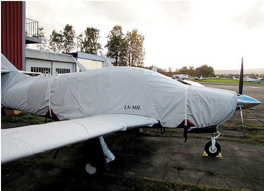
Rockwell Commander Engine, Extended Canopy, Wings, & Empennage Covers