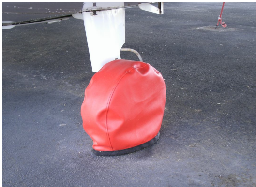
Piper PA28-140 Tire Covers

ALL-YEAR USE MATERIAL - Made with Silver Acrylic Sunbrella canvas, the all-year use material is the best option for sun protection and cover longevity. This heavier more durable material is intended for all weather conditions, such as rain and snow or lots of sun.