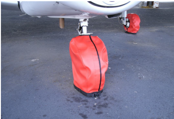
Piper PA28-140 Tire Covers