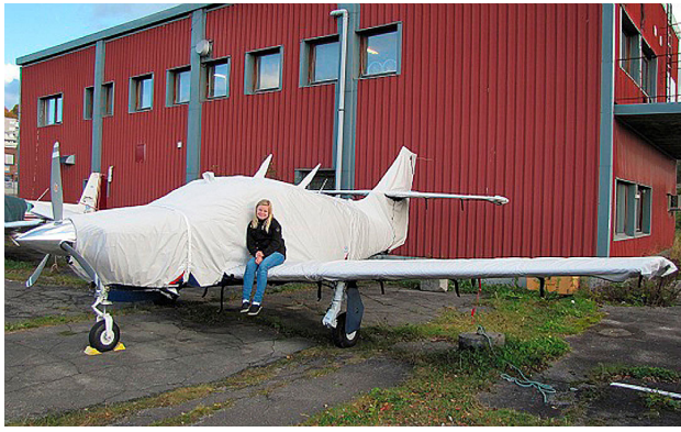
Rockwell Commander Engine, Extended Canopy, Wings, & Empennage Covers