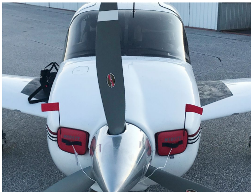
Aero Commander 112 Engine Inlet Plugs

Engine Inlet Plugs are custom fit for your Rockwell Aero Commander 112, 114 intakes, made with heavy-duty vinyl material, and stuffed with a single block of sculpted urethane foam. Each plug has a zipper that allows the foam to be removed and dried if necessary. Engine plugs have warning flags that are visible from the cockpit or 'remove before flight' streamers sewn onto the face of the plugs. Most plugs are imprinted with the aircraft registration number in black for an extra charge. Storage bag NOT included. Engine plugs may be inserted after flight when the engine is still warm. Engine Inlet Plugs are commonly referred to as Cowl Plugs, Intake Plugs, Cowl Blocks, Engine Blocks, and Engine Bungs.