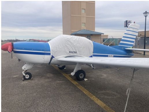
SOCATA Rallye 150 Canopy Cover, Prop Cover