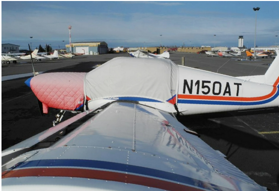
Koliber 150A Canopy Cover, Insulated Engine Cover

This cover type is made from Silver Acrylic Sunbrella canvas and is 100% lined with a soft and smooth microfiber. Bruce's Custom Covers developed this material combination especially for aircraft protection. The outer material is medium weight and treated for water resistance, UV resistance and anti-static buildup. The inner lining is a very soft and smooth microfiber to prevent scratching. The material is very reflective, and tests show that the cabin interior temperature can be reduced to near-ambient temperature on the hottest of days. It is water, ice and snow repellent, yet breathable to allow moisture to escape from between the cover and the aircraft surface.