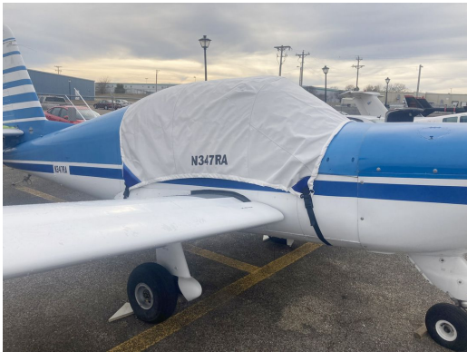
SOCATA Rallye 150 Canopy Cover

The Aerospatiale (Socata) Rallye 150 Canopy/Engine Cover is a one-piece cover (100% lined with microfiber) that is a combination of the Canopy Cover and Engine Cover. This cover will enclose the engine cowl and will extend aft to cover all of the windows. This cover type is made from Silver Acrylic Sunbrella canvas and is 100% lined with a soft and smooth microfiber. Bruce's Custom Covers developed this material combination especially for aircraft protection. The outer material is medium weight and treated for water resistance, UV resistance and anti-static buildup. The inner lining is a very soft and smooth microfiber to prevent scratching. The material is very reflective, and tests show that the cabin interior temperature can be reduced to near-ambient temperature on the hottest of days. It is water, ice and snow repellent, yet breathable to allow moisture to escape from between the cover and the aircraft surface.