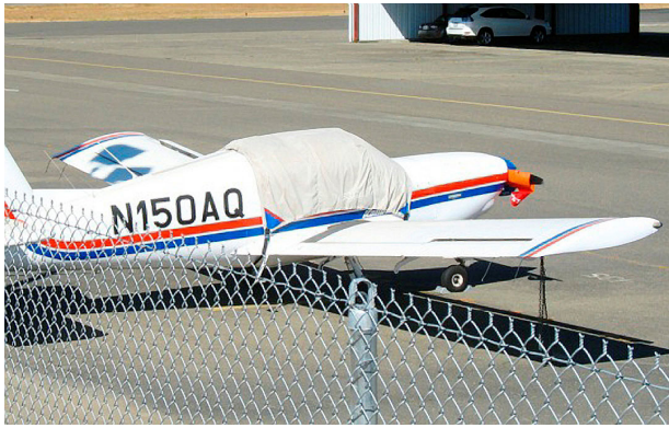
Koliber 150-A Canopy Cover