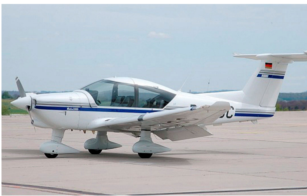
Canopy Cover for the Robin 3140 & R-3000