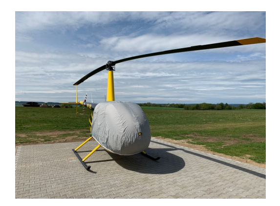
Robinson R-44 RAVEN I TRAVEL COVER