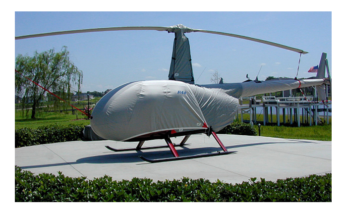
Robinson R-44 Full Cover Set

The Tailboom Cover details vary by model, but generally the helicopter tail boom cover encloses the tail boom from the "bottleneck" to the aft end. They usually also cover the horizontal stabilizers, and are custom made to allow for antennae, lights, and other protrusions. They attach with straps underneath the tail boom. Covers for the vertical and horizontal stabilizers are also available separately. Specific information for each model is available on request.