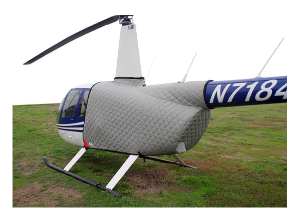
Robinson R-44 Insulated Engine Cover

WINTER USE MATERIAL - Made with Solution-Dyed Polyester fabric, this option is intended for seasonal use to aid in deicing, rain mitigation, or for occasional travel. The material is lighter and more compact, but more susceptible to UV damage and may have a shorter useful life if used continuously outside than the all-year use material.