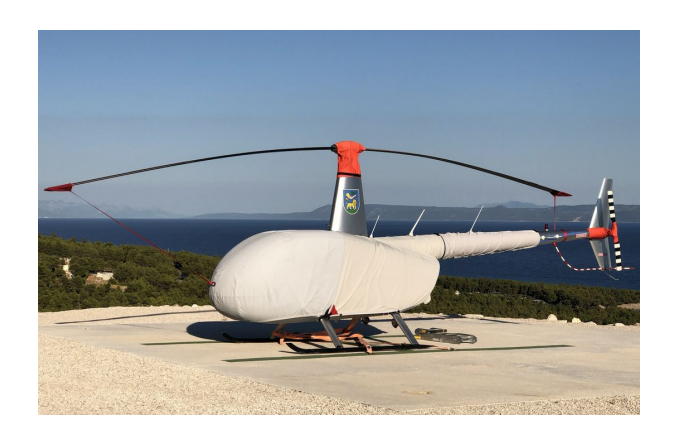
Robinson R-44 Travel Bubble Cover, Engine Cover, etc.

Travel Covers are made with Silver Solution-Dyed Polyester fabric and fully lined over the entire cover. The material is lightweight and more compact for easy stowage in the aircraft. The polyester material is water resistant, but only intended for occasional use outside. We also have an ultra lightweight material available for fitted hangar dust covers. For daily outdoor use, the non-travel Sunbrella Cover is the best choice.