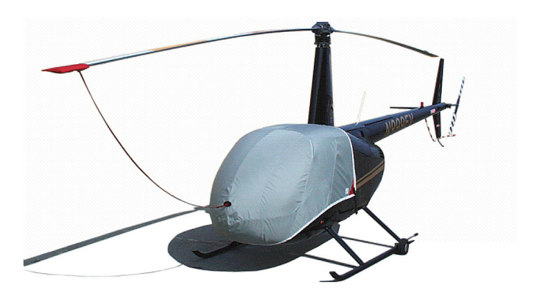
Robinson R-44 Bubble Cover (snap-on type), Front Blade Tie-Down