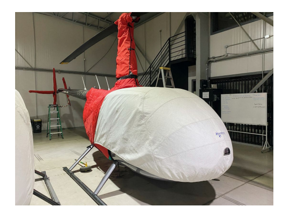
Robinson R-44 Insulated Rotor Mast & Engine Covers