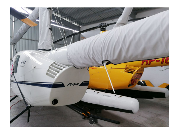
Robinson R-44 Tailboom, Rotor Mast & Blade Covers