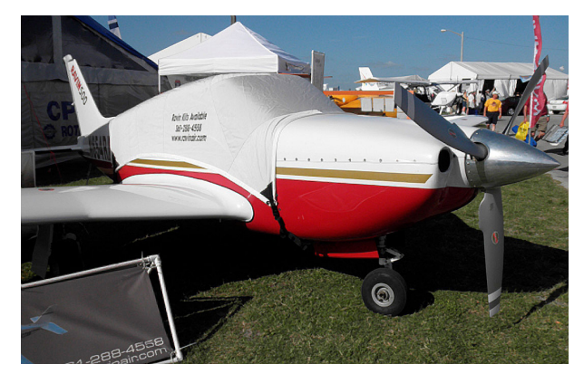
Piper Comanche Canopy & Engine Covers