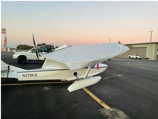
SeaRey Wing Covers