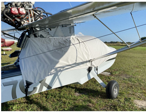
SeaRey Canopy/Nose Cover