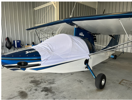
SeaRey Cockpit ONLY Cover, test fit cover