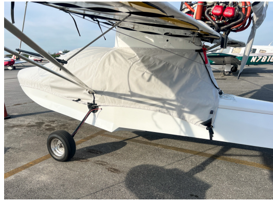
SeaRey/Progressive Aerodyne SeaRey Amphibian Canopy/Nose Cover