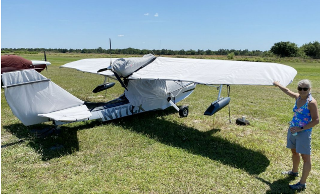
Searey Complete Cover Set

WINTER USE MATERIAL - Made with Solution-Dyed Polyester fabric, this option is intended for seasonal use to aid in deicing, rain mitigation, or for occasional travel. The material is lighter and more compact, but more susceptible to UV damage and may have a shorter useful life if used continuously outside than the all-year use material.