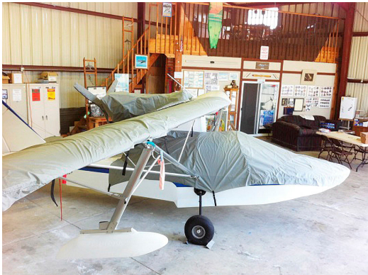
SeaRey Canopy, Engine & Wing (test fit covers)

WINTER USE MATERIAL - Made with Solution-Dyed Polyester fabric, this option is intended for seasonal use to aid in deicing, rain mitigation, or for occasional travel. The material is lighter and more compact, but more susceptible to UV damage and may have a shorter useful life if used continuously outside than the all-year use material.