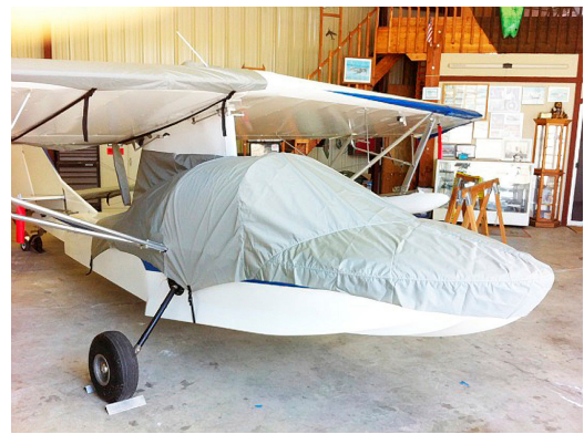
SeaRey Canopy Cover (test fit cover)