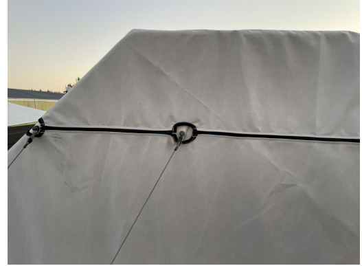
SeaRey Empennage Cover