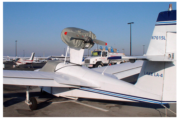
Lake Canopy & Engine Covers