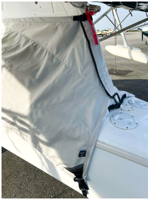
SeaRey/Progressive Aerodyne SeaRey Amphibian Canopy/Nose Cover