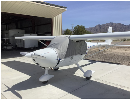
Remos G-3/600 Travel Cover