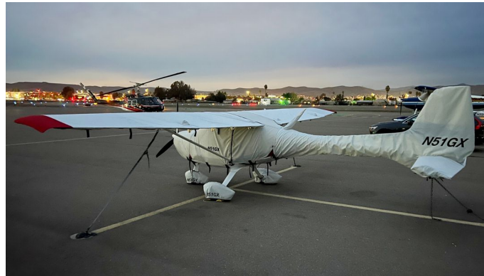
Remos RG-3 Complete Cover Set

ALL-YEAR USE MATERIAL - Made with Silver Acrylic Sunbrella canvas, the all-year use material is the best option for sun protection and cover longevity. This heavier more durable material is intended for all weather conditions, such as rain and snow or lots of sun.