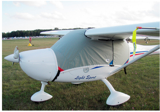
Remos G3 Travel Weight Canopy Cover