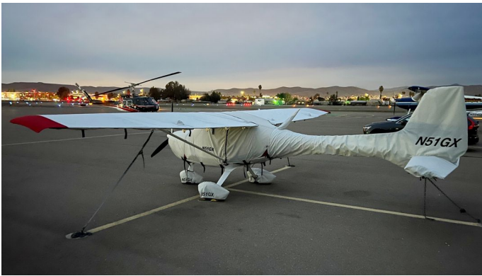
Remos RG-3 Complete Cover Set

This cover type is made from Silver Acrylic Sunbrella canvas and is 100% lined with a soft and smooth microfiber. Bruce's Custom Covers developed this material combination especially for aircraft protection. The outer material is medium weight and treated for water resistance, UV resistance and anti-static buildup. The inner lining is a very soft and smooth microfiber to prevent scratching. The material is very reflective, and tests show that the cabin interior temperature can be reduced to near-ambient temperature on the hottest of days. It is water, ice and snow repellent, yet breathable to allow moisture to escape from between the cover and the aircraft surface.