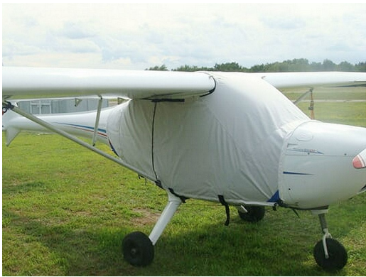
Remos G3 & GX MODELS Extended Canopy Cover (Over-The-Top Style)

This cover type is made from Silver Acrylic Sunbrella canvas and is 100% lined with a soft and smooth microfiber. Bruce's Custom Covers developed this material combination especially for aircraft protection. The outer material is medium weight and treated for water resistance, UV resistance and anti-static buildup. The inner lining is a very soft and smooth microfiber to prevent scratching. The material is very reflective, and tests show that the cabin interior temperature can be reduced to near-ambient temperature on the hottest of days. It is water, ice and snow repellent, yet breathable to allow moisture to escape from between the cover and the aircraft surface.