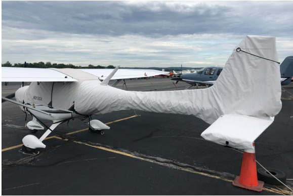
Remos G3 & GX MODELS Empennage Cover