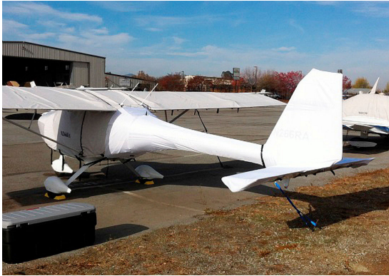
Remos Empennage Cover (test fit cover)

WINTER USE MATERIAL - Made with Solution-Dyed Polyester fabric, this option is intended for seasonal use to aid in deicing, rain mitigation, or for occasional travel. The material is lighter and more compact, but more susceptible to UV damage and may have a shorter useful life if used continuously outside than the all-year use material.