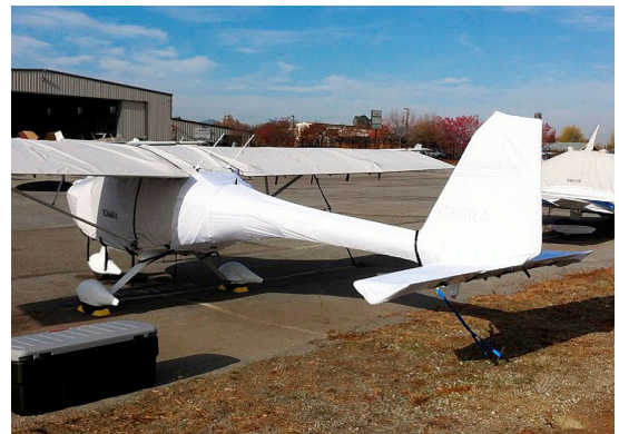
Remos Empennage Cover (test fit cover)