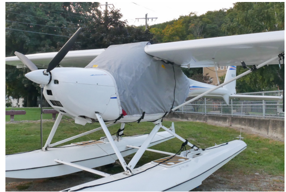
Remos G3 Extended Canopy Cover (Over-Top-Type Style)