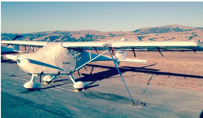
Remos Extended Canopy/Engine, Wing Covers

WINTER USE MATERIAL - Made with Solution-Dyed Polyester fabric, this option is intended for seasonal use to aid in deicing, rain mitigation, or for occasional travel. The material is lighter and more compact, but more susceptible to UV damage and may have a shorter useful life if used continuously outside than the all-year use material.