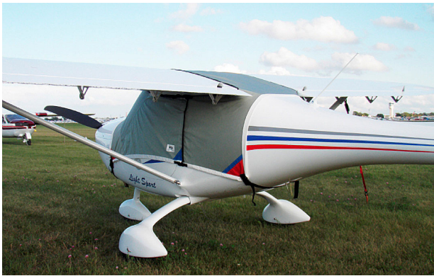
Remos G3 Travel Weight Canopy Cover

This cover type is made from Silver Acrylic Sunbrella canvas and is 100% lined with a soft and smooth microfiber. Bruce's Custom Covers developed this material combination especially for aircraft protection. The outer material is medium weight and treated for water resistance, UV resistance and anti-static buildup. The inner lining is a very soft and smooth microfiber to prevent scratching. The material is very reflective, and tests show that the cabin interior temperature can be reduced to near-ambient temperature on the hottest of days. It is water, ice and snow repellent, yet breathable to allow moisture to escape from between the cover and the aircraft surface.