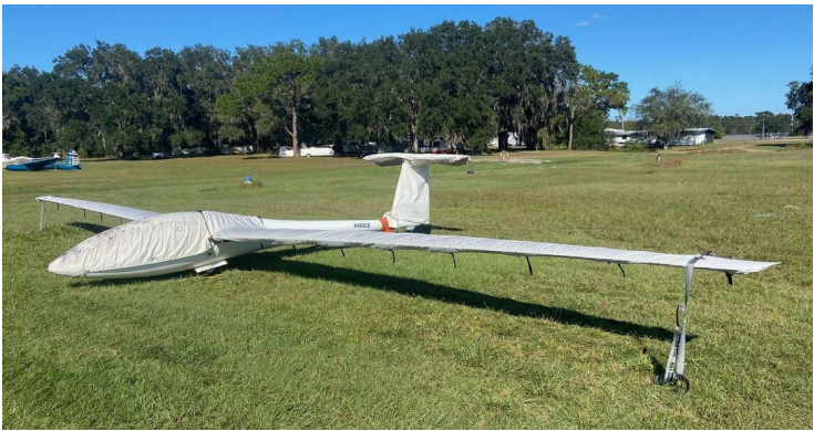
Rolladen-Schneider LS-4 Wing Covers

WINTER USE MATERIAL - Made with Solution-Dyed Polyester fabric, this option is intended for seasonal use to aid in deicing, rain mitigation, or for occasional travel. The material is lighter and more compact, but more susceptible to UV damage and may have a shorter useful life if used continuously outside than the all-year use material.