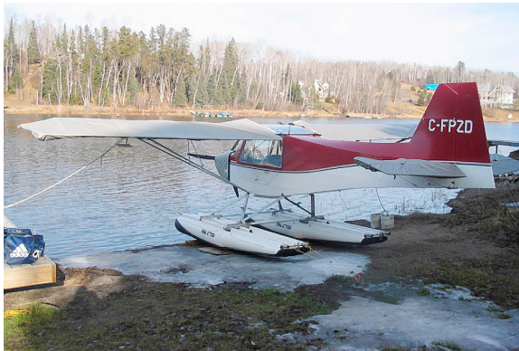
Rans S-7 Insulated Engine Cover, Wing Covers and Horizontal Stabilizer Covers

WINTER USE MATERIAL - Made with Solution-Dyed Polyester fabric, this option is intended for seasonal use to aid in deicing, rain mitigation, or for occasional travel. The material is lighter and more compact, but more susceptible to UV damage and may have a shorter useful life if used continuously outside than the all-year use material.