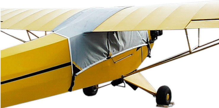
Piper J3 Over-Top Canopy Cover