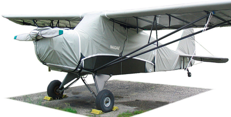
Prop Cover, Engine Cover, Canopy Cover, Wing Covers and Empennage Cover