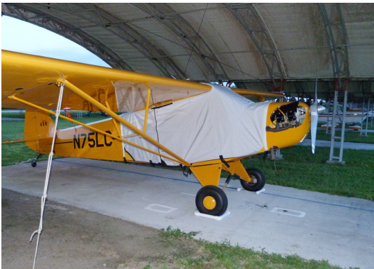
Piper J-3 Extended Canopy Cover

This cover type is made from Silver Acrylic Sunbrella canvas and is 100% lined with a soft and smooth microfiber. Bruce's Custom Covers developed this material combination especially for aircraft protection. The outer material is medium weight and treated for water resistance, UV resistance and anti-static buildup. The inner lining is a very soft and smooth microfiber to prevent scratching. The material is very reflective, and tests show that the cabin interior temperature can be reduced to near-ambient temperature on the hottest of days. It is water, ice and snow repellent, yet breathable to allow moisture to escape from between the cover and the aircraft surface.