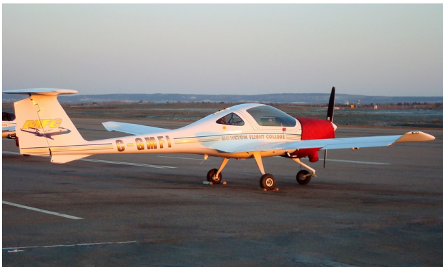
Diamond DA-20 Insulated Engine Cover

This cover type is made from Silver Acrylic Sunbrella canvas and is 100% lined with a soft and smooth microfiber. Bruce's Custom Covers developed this material combination especially for aircraft protection. The outer material is medium weight and treated for water resistance, UV resistance and anti-static buildup. The inner lining is a very soft and smooth microfiber to prevent scratching. The material is very reflective, and tests show that the cabin interior temperature can be reduced to near-ambient temperature on the hottest of days. It is water, ice and snow repellent, yet breathable to allow moisture to escape from between the cover and the aircraft surface.