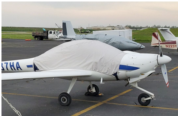
Diamond DA-20 Katana

This cover type is made from Silver Acrylic Sunbrella canvas and is 100% lined with a soft and smooth microfiber. Bruce's Custom Covers developed this material combination especially for aircraft protection. The outer material is medium weight and treated for water resistance, UV resistance and anti-static buildup. The inner lining is a very soft and smooth microfiber to prevent scratching. The material is very reflective, and tests show that the cabin interior temperature can be reduced to near-ambient temperature on the hottest of days. It is water, ice and snow repellent, yet breathable to allow moisture to escape from between the cover and the aircraft surface.