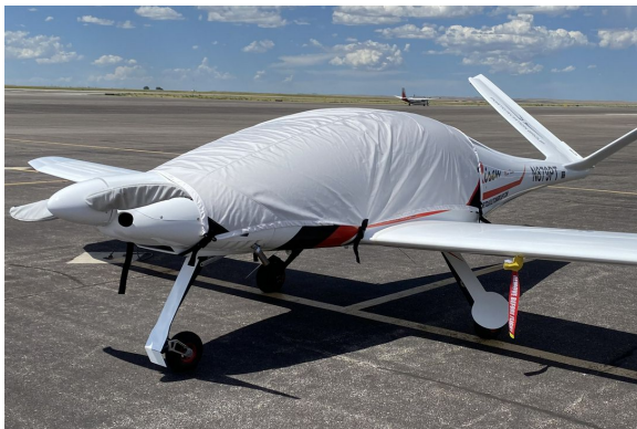
Swiss Excellence Risen 914 Canopy Cover