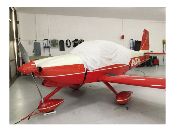
Van's Aircraft RV-10 Canopy Cover

This cover type is made from Silver Acrylic Sunbrella canvas and is 100% lined with a soft and smooth microfiber. Bruce's Custom Covers developed this material combination especially for aircraft protection. The outer material is medium weight and treated for water resistance, UV resistance and anti-static buildup. The inner lining is a very soft and smooth microfiber to prevent scratching. The material is very reflective, and tests show that the cabin interior temperature can be reduced to near-ambient temperature on the hottest of days. It is water, ice and snow repellent, yet breathable to allow moisture to escape from between the cover and the aircraft surface.