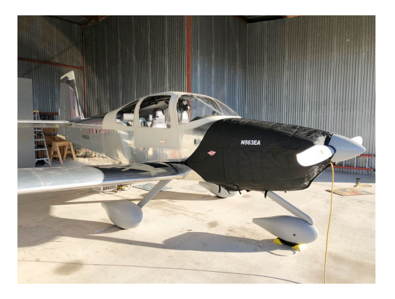
Van's RV-10 Fully Enclosed Insulated Engine Cover