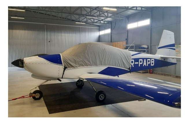
Van's RV-10 Travel Weight Canopy Cover