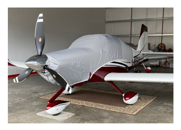
Van's RV-10 Travel Cover

Travel Covers are made with Silver Solution-Dyed Polyester fabric and only lined over the windshield to save weight. The material is lightweight and more compact for easy stowage in the aircraft. The polyester material is water resistant, but only intended for occasional use outside. We also have an ultra lightweight material available for fitted hangar dust covers. For daily outdoor use, the non-travel Sunbrella Cover is the best choice.