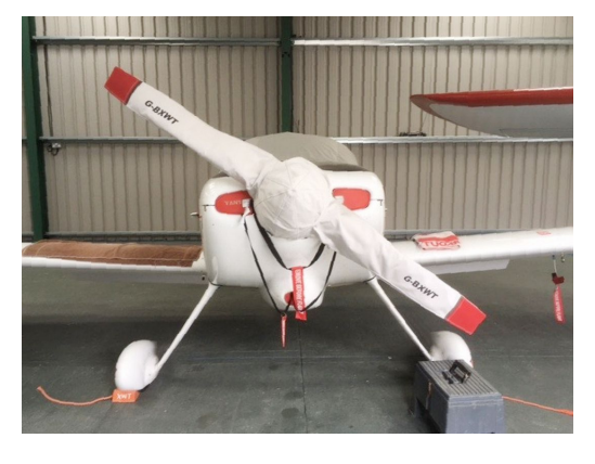
Van's RV-6 Prop/Spinner Cover

This cover type is made from Silver Acrylic Sunbrella canvas and is 100% lined with a soft and smooth microfiber. Bruce's Custom Covers developed this material combination especially for aircraft protection. The outer material is medium weight and treated for water resistance, UV resistance and anti-static buildup. The inner lining is a very soft and smooth microfiber to prevent scratching. The material is very reflective, and tests show that the cabin interior temperature can be reduced to near-ambient temperature on the hottest of days. It is water, ice and snow repellent, yet breathable to allow moisture to escape from between the cover and the aircraft surface.