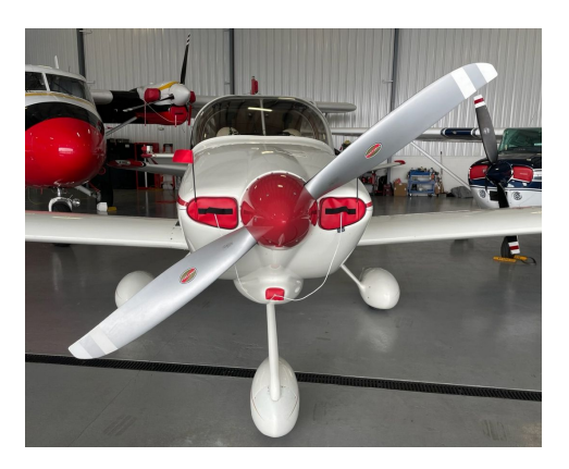
Van's RV-10 Engine Inlet Plugs