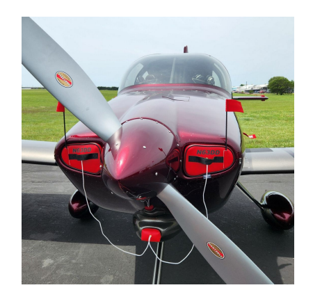
RV-10 Engine Inlet Plugs

Engine Inlet Plugs are custom fit for your Van's Aircraft RV-10 intakes, made with heavy-duty vinyl material, and stuffed with a single block of sculpted urethane foam. Each plug has a zipper that allows the foam to be removed and dried if necessary. Engine plugs have warning flags that are visible from the cockpit or 'remove before flight' streamers sewn onto the face of the plugs. Most plugs are imprinted with the aircraft registration number in black for an extra charge. Storage bag NOT included. Engine plugs may be inserted after flight when the engine is still warm. Engine Inlet Plugs are commonly referred to as Cowl Plugs, Intake Plugs, Cowl Blocks, Engine Blocks, and Engine Bungs.