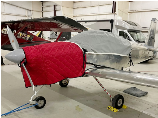
Vans RV-7 Travel Canopy Cover, Hangar Blanket

This cover type is made from Silver Acrylic Sunbrella canvas and is 100% lined with a soft and smooth microfiber. Bruce's Custom Covers developed this material combination especially for aircraft protection. The outer material is medium weight and treated for water resistance, UV resistance and anti-static buildup. The inner lining is a very soft and smooth microfiber to prevent scratching. The material is very reflective, and tests show that the cabin interior temperature can be reduced to near-ambient temperature on the hottest of days. It is water, ice and snow repellent, yet breathable to allow moisture to escape from between the cover and the aircraft surface.