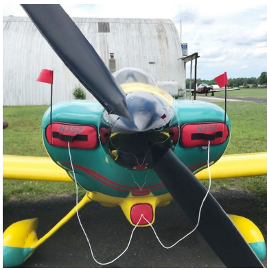
Van's Aircraft RV-4 Engine Inlet Plugs