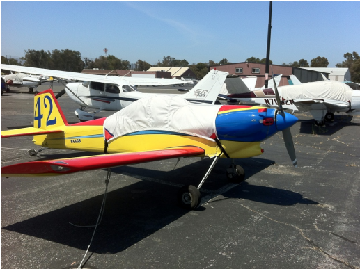
Vans's RV-3 Canopy Cover, Engine Plugs

This cover type is made from Silver Acrylic Sunbrella canvas and is 100% lined with a soft and smooth microfiber. Bruce's Custom Covers developed this material combination especially for aircraft protection. The outer material is medium weight and treated for water resistance, UV resistance and anti-static buildup. The inner lining is a very soft and smooth microfiber to prevent scratching. The material is very reflective, and tests show that the cabin interior temperature can be reduced to near-ambient temperature on the hottest of days. It is water, ice and snow repellent, yet breathable to allow moisture to escape from between the cover and the aircraft surface.