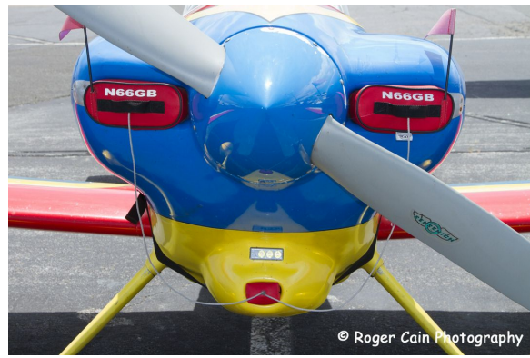
Van's RV-3 Engine Plugs