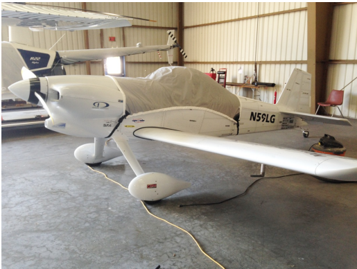
Van's RV-3 Light Weight Travel Cover

Travel Covers are made with Silver Solution-Dyed Polyester fabric and only lined over the windshield to save weight. The material is lightweight and more compact for easy stowage in the aircraft. The polyester material is water resistant, but only intended for occasional use outside. We also have an ultra lightweight material available for fitted hangar dust covers. For daily outdoor use, the non-travel Sunbrella Cover is the best choice.