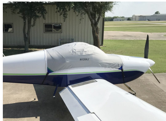
Van's RV-9A Travel Weight Canopy Cover