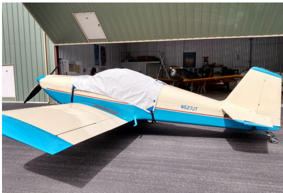
Van's RV-6 Canopy Cover

This cover type is made from Silver Acrylic Sunbrella canvas and is 100% lined with a soft and smooth microfiber. Bruce's Custom Covers developed this material combination especially for aircraft protection. The outer material is medium weight and treated for water resistance, UV resistance and anti-static buildup. The inner lining is a very soft and smooth microfiber to prevent scratching. The material is very reflective, and tests show that the cabin interior temperature can be reduced to near-ambient temperature on the hottest of days. It is water, ice and snow repellent, yet breathable to allow moisture to escape from between the cover and the aircraft surface.