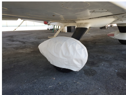
Grumman AA5 Main Wheelpant Cover, test fit