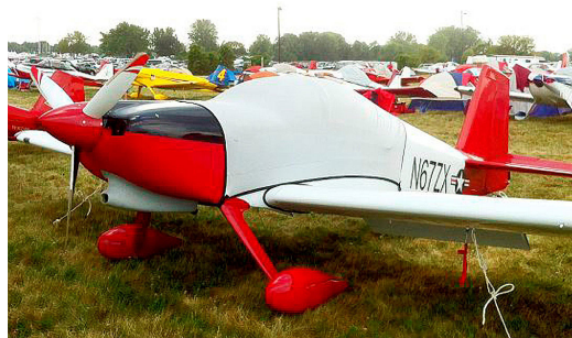
Light Weight Fitted Hangar Dust Cover

Travel Covers are made with Silver Solution-Dyed Polyester fabric and only lined over the windshield to save weight. The material is lightweight and more compact for easy stowage in the aircraft. The polyester material is water resistant, but only intended for occasional use outside. We also have an ultra lightweight material available for fitted hangar dust covers. For daily outdoor use, the non-travel Sunbrella Cover is the best choice.