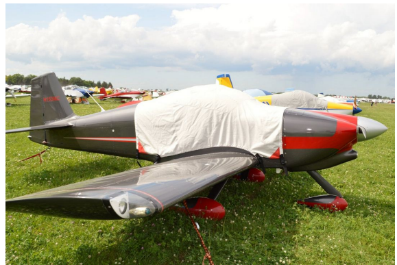
Van's RV-7A Extended Canopy Cover