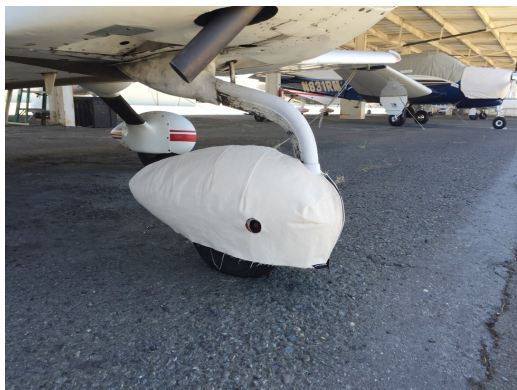
Grumman AA5 Nose Wheelpant Cover, test fit