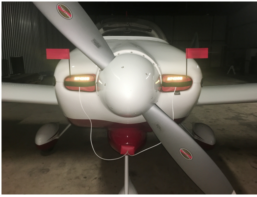
Van's Aircraft RV-7A Engine Inlet Plugs