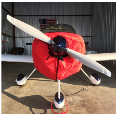
Van's RV-9A Insulated Engine Cover