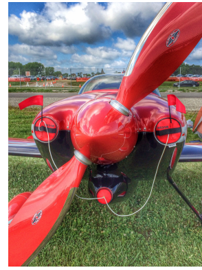
Van's RV-7 Engine Inlet Plugs