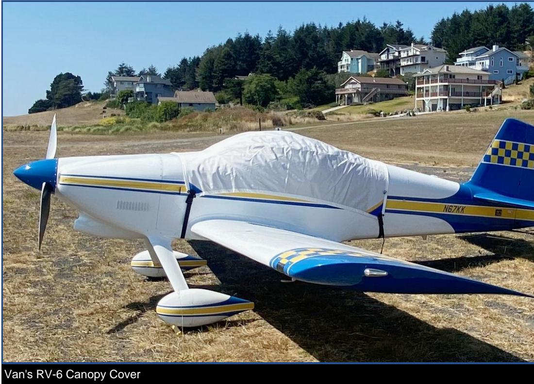
Van's RV-6 Canopy Cover