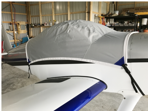
Van's Aircraft RV-9 Travel Cover, Light Weight Travel Canopy Cover

Travel Covers are made with Silver Solution-Dyed Polyester fabric and only lined over the windshield to save weight. The material is lightweight and more compact for easy stowage in the aircraft. The polyester material is water resistant, but only intended for occasional use outside. We also have an ultra lightweight material available for fitted hangar dust covers. For daily outdoor use, the non-travel Sunbrella Cover is the best choice.