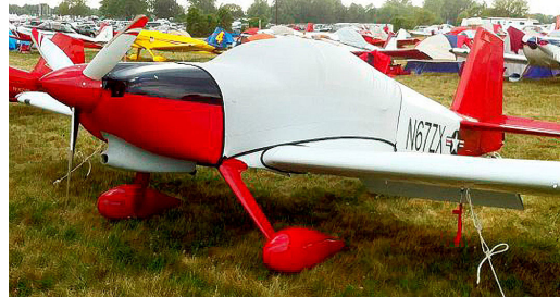
Light Weight Fitted Hangar Dust Cover