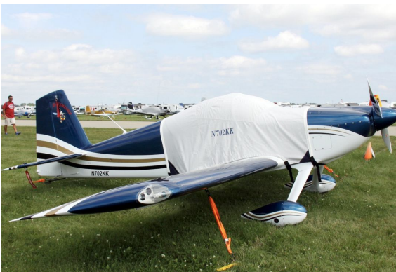
Van's RV-7 Extended Canopy Cover

This cover type is made from Silver Acrylic Sunbrella canvas and is 100% lined with a soft and smooth microfiber. Bruce's Custom Covers developed this material combination especially for aircraft protection. The outer material is medium weight and treated for water resistance, UV resistance and anti-static buildup. The inner lining is a very soft and smooth microfiber to prevent scratching. The material is very reflective, and tests show that the cabin interior temperature can be reduced to near-ambient temperature on the hottest of days. It is water, ice and snow repellent, yet breathable to allow moisture to escape from between the cover and the aircraft surface.