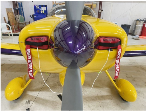
Van's Aircraft RV-7 Engine Inlet Plugs