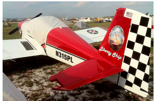
Van's RV-7 Canopy Cover