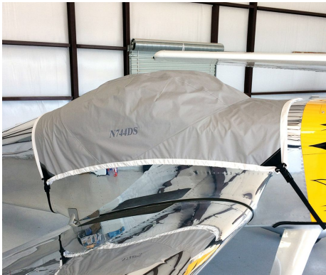
Van's RV-7 Lightweight Travel Canopy Cover

Travel Covers are made with Silver Solution-Dyed Polyester fabric and only lined over the windshield to save weight. The material is lightweight and more compact for easy stowage in the aircraft. The polyester material is water resistant, but only intended for occasional use outside. We also have an ultra lightweight material available for fitted hangar dust covers. For daily outdoor use, the non-travel Sunbrella Cover is the best choice.