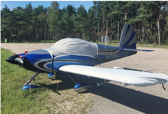
Van's RV-7/7A Travel and Wing Covers