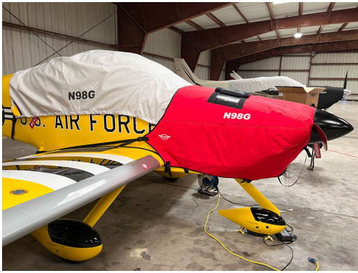
Van's Aircraft RV-7/7A Insulated Engine Cover