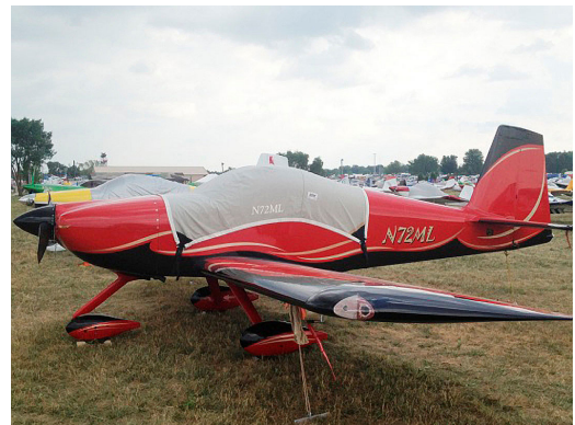
Van's RV-7 Canopy Cover