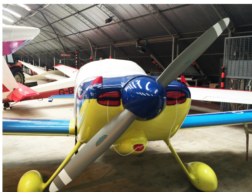
Van's RV-6 Engine Inlet Plugs