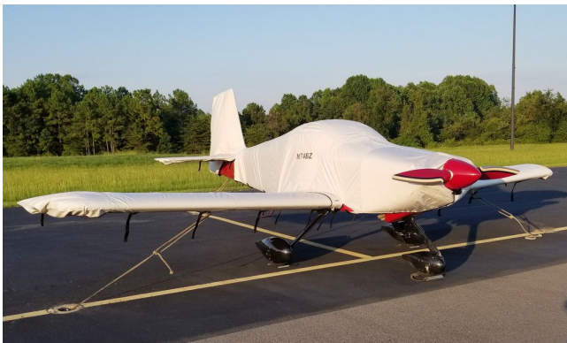
Van's RV-7A Complete Cover Set

This cover type is made from Silver Acrylic Sunbrella canvas and is 100% lined with a soft and smooth microfiber. Bruce's Custom Covers developed this material combination especially for aircraft protection. The outer material is medium weight and treated for water resistance, UV resistance and anti-static buildup. The inner lining is a very soft and smooth microfiber to prevent scratching. The material is very reflective, and tests show that the cabin interior temperature can be reduced to near-ambient temperature on the hottest of days. It is water, ice and snow repellent, yet breathable to allow moisture to escape from between the cover and the aircraft surface.