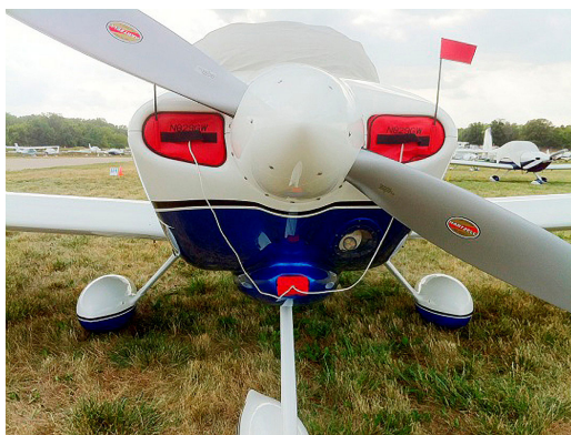
Van's RV-10 Canopy Cover & Engine Inlet Plugs