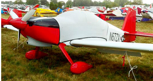
Light Weight Fitted Hangar Dust Cover