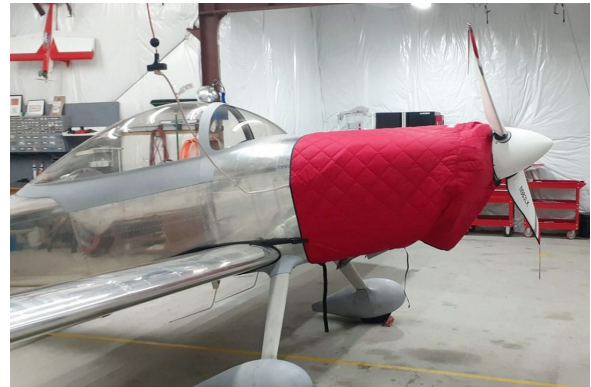
Van's Aircraft RV-8/8A Insulated Hangar Blanket, Interior Use