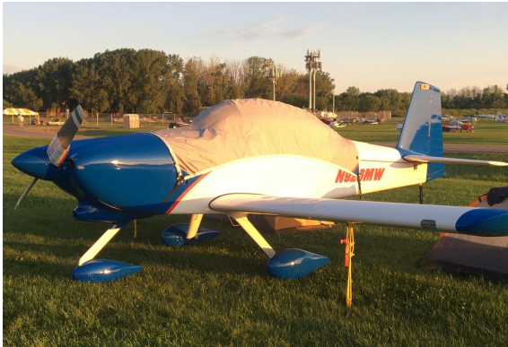
Van's' RV-8 Light Weight Travel Cover

Travel Covers are made with Silver Solution-Dyed Polyester fabric and only lined over the windshield to save weight. The material is lightweight and more compact for easy stowage in the aircraft. The polyester material is water resistant, but only intended for occasional use outside. We also have an ultra lightweight material available for fitted hangar dust covers. For daily outdoor use, the non-travel Sunbrella Cover is the best choice.