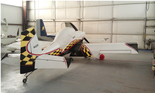
Van's RV-8 Canopy Cover

This cover type is made from Silver Acrylic Sunbrella canvas and is 100% lined with a soft and smooth microfiber. Bruce's Custom Covers developed this material combination especially for aircraft protection. The outer material is medium weight and treated for water resistance, UV resistance and anti-static buildup. The inner lining is a very soft and smooth microfiber to prevent scratching. The material is very reflective, and tests show that the cabin interior temperature can be reduced to near-ambient temperature on the hottest of days. It is water, ice and snow repellent, yet breathable to allow moisture to escape from between the cover and the aircraft surface.