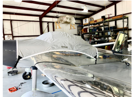
Van's RV-8 Light Weight Travel Canopy Cover