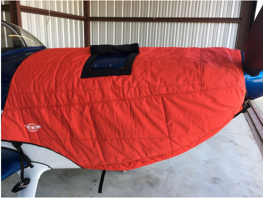
Van's RV-8 Insulated Engine Cover with Oil Filler Preheater access flap