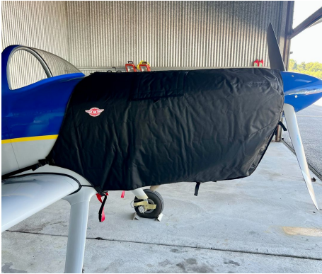
Van's RV8 Insulated Engine Cover

This cover type is made from Silver Acrylic Sunbrella canvas and is 100% lined with a soft and smooth microfiber. Bruce's Custom Covers developed this material combination especially for aircraft protection. The outer material is medium weight and treated for water resistance, UV resistance and anti-static buildup. The inner lining is a very soft and smooth microfiber to prevent scratching. The material is very reflective, and tests show that the cabin interior temperature can be reduced to near-ambient temperature on the hottest of days. It is water, ice and snow repellent, yet breathable to allow moisture to escape from between the cover and the aircraft surface.