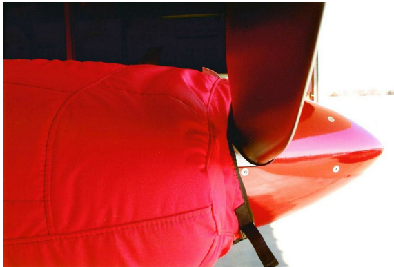
Van's RV-8/8A Insulated Engine Cover

This cover type is made from Silver Acrylic Sunbrella canvas and is 100% lined with a soft and smooth microfiber. Bruce's Custom Covers developed this material combination especially for aircraft protection. The outer material is medium weight and treated for water resistance, UV resistance and anti-static buildup. The inner lining is a very soft and smooth microfiber to prevent scratching. The material is very reflective, and tests show that the cabin interior temperature can be reduced to near-ambient temperature on the hottest of days. It is water, ice and snow repellent, yet breathable to allow moisture to escape from between the cover and the aircraft surface.