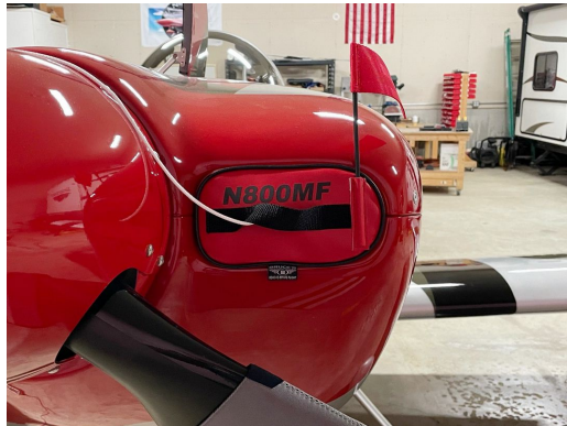
Van's RV-8 Engine Inlet Plugs

Engine Inlet Plugs are custom fit for your Van's Aircraft RV-8/8A intakes, made with heavy-duty vinyl material, and stuffed with a single block of sculpted urethane foam. Each plug has a zipper that allows the foam to be removed and dried if necessary. Engine plugs have warning flags that are visible from the cockpit or 'remove before flight' streamers sewn onto the face of the plugs. Most plugs are imprinted with the aircraft registration number in black for an extra charge. Storage bag NOT included. Engine plugs may be inserted after flight when the engine is still warm. Engine Inlet Plugs are commonly referred to as Cowl Plugs, Intake Plugs, Cowl Blocks, Engine Blocks, and Engine Bungs.