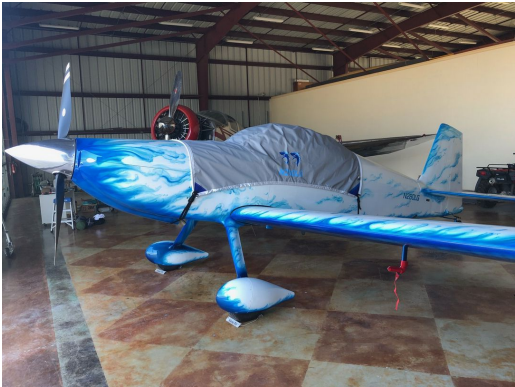
Van's RV-8 Fastback Travel Canopy Cover