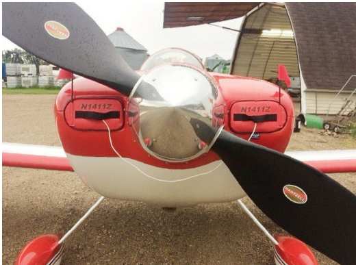
Van's RV-8 Engine Plugs

Engine Inlet Plugs are custom fit for your Van's Aircraft RV-8/8A intakes, made with heavy-duty vinyl material, and stuffed with a single block of sculpted urethane foam. Each plug has a zipper that allows the foam to be removed and dried if necessary. Engine plugs have warning flags that are visible from the cockpit or 'remove before flight' streamers sewn onto the face of the plugs. Most plugs are imprinted with the aircraft registration number in black for an extra charge. Storage bag NOT included. Engine plugs may be inserted after flight when the engine is still warm. Engine Inlet Plugs are commonly referred to as Cowl Plugs, Intake Plugs, Cowl Blocks, Engine Blocks, and Engine Bungs.