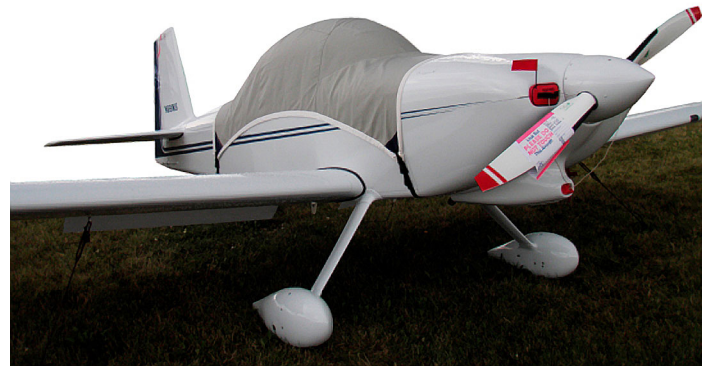
Van's RV-8 Canopy Cover & Engine Inlet Plugs