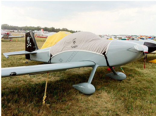
Van's RV-8 Canopy Cover

This cover type is made from Silver Acrylic Sunbrella canvas and is 100% lined with a soft and smooth microfiber. Bruce's Custom Covers developed this material combination especially for aircraft protection. The outer material is medium weight and treated for water resistance, UV resistance and anti-static buildup. The inner lining is a very soft and smooth microfiber to prevent scratching. The material is very reflective, and tests show that the cabin interior temperature can be reduced to near-ambient temperature on the hottest of days. It is water, ice and snow repellent, yet breathable to allow moisture to escape from between the cover and the aircraft surface.