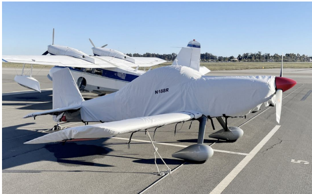
Van's RV-8 Complete Cover