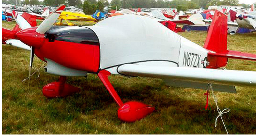
Light Weight Fitted Hangar Dust Cover

lightweight and more compact for easy stowage in the aircraft. The polyester material is water resistant, but only intended for occasional use outside. We also have an ultra lightweight material available for fitted hangar dust covers. For daily outdoor use, the non-travel Sunbrella Cover is the best choice.