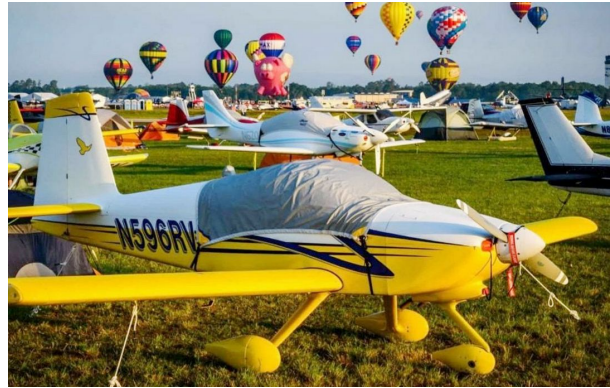
Vans's RV-9 Travel Weight Canopy Cover at Sun 'n Fun