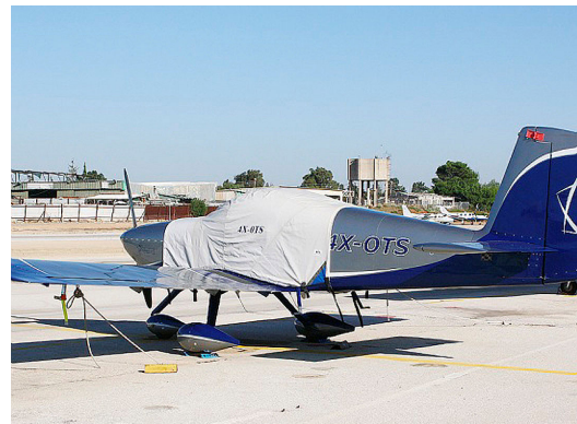
Van's RV-9 Extended Canopy Cover