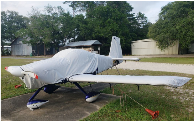
Van's RV-7A Cover Set

WINTER USE MATERIAL - Made with Solution-Dyed Polyester fabric, this option is intended for seasonal use to aid in deicing, rain mitigation, or for occasional travel. The material is lighter and more compact, but more susceptible to UV damage and may have a shorter useful life if used continuously outside than the all-year use material.