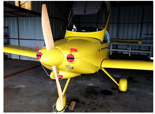
Van's RV-9A Engine Inlet Plugs