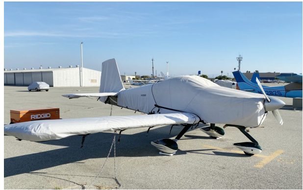
Van's RV-9A Extended Canopy/Engine, Wing & Empennage Covers