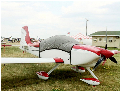
Van's RV-9 Canopy Cover

This cover type is made from Silver Acrylic Sunbrella canvas and is 100% lined with a soft and smooth microfiber. Bruce's Custom Covers developed this material combination especially for aircraft protection. The outer material is medium weight and treated for water resistance, UV resistance and anti-static buildup. The inner lining is a very soft and smooth microfiber to prevent scratching. The material is very reflective, and tests show that the cabin interior temperature can be reduced to near-ambient temperature on the hottest of days. It is water, ice and snow repellent, yet breathable to allow moisture to escape from between the cover and the aircraft surface.