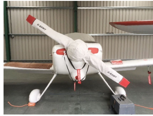
Van's RV-6 Prop/Spinner Cover