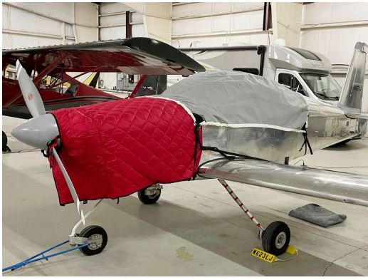
Vans RV-7 Travel Canopy Cover, Hangar Blanket