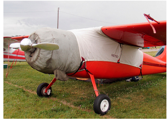
Cessna 195 Over-Top Canopy Cover & Engine Cover