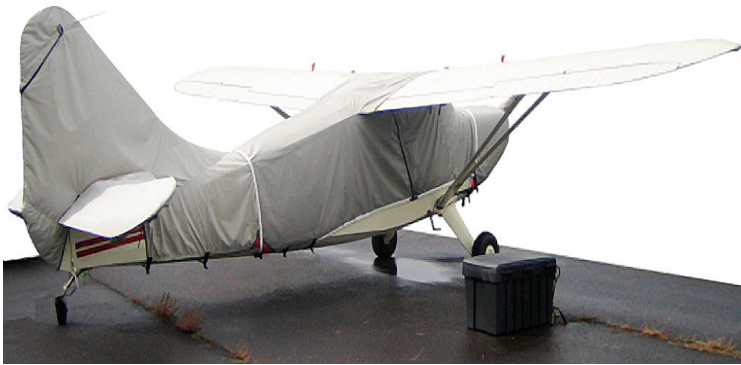
Stinson 108 Canopy, Engine, Prop & Empennage Covers

The material is very reflective, and tests show that the cabin interior temperature can be reduced to near-ambient temperature on the hottest of days. It is water, ice and snow repellent, yet breathable to allow moisture to escape from between the cover and the aircraft surface.