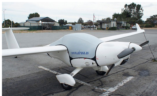
Lambda Travel Canopy Cover