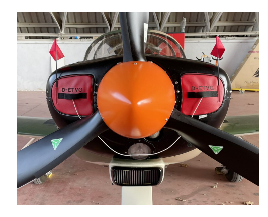
Marcheti SF260C Inlet Plugs

Engine Inlet Plugs are custom fit for your Siai Marchetti SF260 intakes, made with heavy-duty vinyl material, and stuffed with a single block of sculpted urethane foam. Each plug has a zipper that allows the foam to be removed and dried if necessary. Engine plugs have warning flags that are visible from the cockpit or 'remove before flight' streamers sewn onto the face of the plugs. Most plugs are imprinted with the aircraft registration number in black for an extra charge. Storage bag NOT included. Engine plugs may be inserted after flight when the engine is still warm. Engine Inlet Plugs are commonly referred to as Cowl Plugs, Intake Plugs, Cowl Blocks, Engine Blocks, and Engine Bungs.