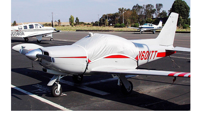
1974 Siai-Marchetti SF 260B Canopy Cover with customized Imprint