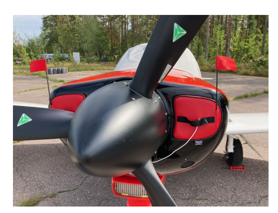
Siai Marchetti SF260 Engine Plugs