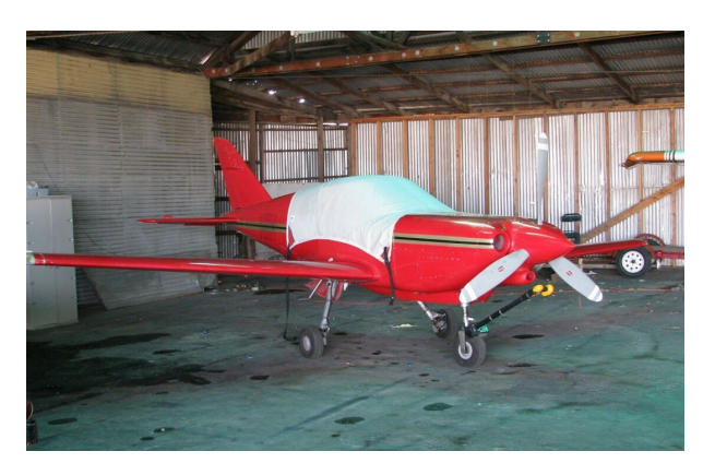
The Sweringen SX300 Canopy Cover