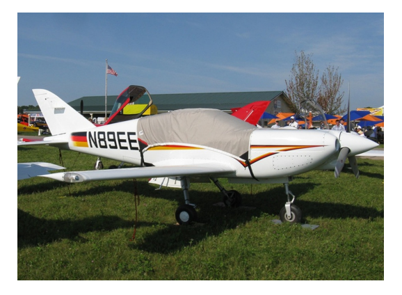
The Sweringen SX300 Canopy Cover

Travel Covers are made with Silver Solution-Dyed Polyester fabric and only lined over the windshield to save weight. The material is lightweight and more compact for easy stowage in the aircraft. The polyester material is water resistant, but only intended for occasional use outside. We also have an ultra lightweight material available for fitted hangar dust covers. For daily outdoor use, the non-travel Sunbrella Cover is the best choice.