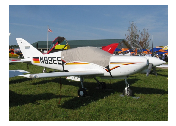
The Sweringen SX300 Canopy Cover