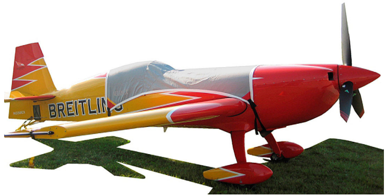
Extra 300sc Canopy Cover