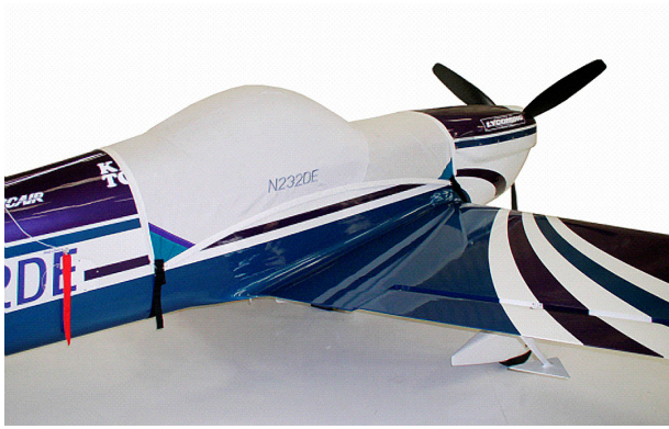
Cap 232 Canopy Cover