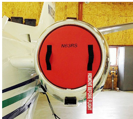
Cessna Citation S-550 Intake Plugs