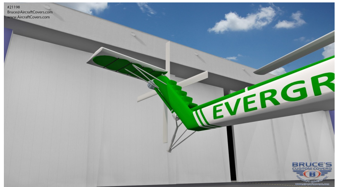
Sikorsky S-64 Skycrane, CH-54 Tarhe Insulated Engine, Rotor Sikorsky S-64 Canopy/Nose, Engine Area, Blade, Rotor, Tail Rotor Hub, Tailboom, Stabilizer & Tail Rotor Covers (illustration)