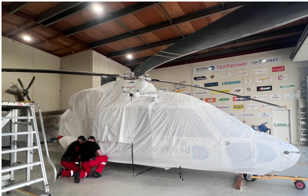
Sikorsky S76C Forward Canopy Cover, Engine Cover (test fit covers)