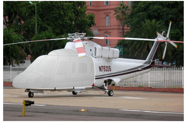
Sikorsky S76 Bubble Cover (Forward Canopy Cover)