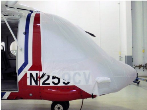
Sikorsky S-92 Windshield/Nose Cover, test fit cover

This cover type is made from Silver Acrylic Sunbrella canvas and is 100% lined with a soft and smooth microfiber. Bruce's Custom Covers developed this material combination especially for aircraft protection. The outer material is medium weight and treated for water resistance, UV resistance and anti-static buildup. The inner lining is a very soft and smooth microfiber to prevent scratching. The material is very reflective, and tests show that the cabin interior temperature can be reduced to near-ambient temperature on the hottest of days. It is water, ice and snow repellent, yet breathable to allow moisture to escape from between the cover and the aircraft surface.