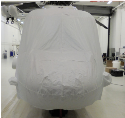
Sikorsky S-92 Windshield/Nose Cover, test fit cover