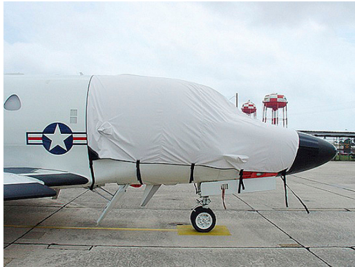
Sabre 40 Cockpit Cover

This cover type is made from Silver Acrylic Sunbrella canvas and is 100% lined with a soft and smooth microfiber. Bruce's Custom Covers developed this material combination especially for aircraft protection. The outer material is medium weight and treated for water resistance, UV resistance and anti-static buildup. The inner lining is a very soft and smooth microfiber to prevent scratching. The material is very reflective, and tests show that the cabin interior temperature can be reduced to near-ambient temperature on the hottest of days. It is water, ice and snow repellent, yet breathable to allow moisture to escape from between the cover and the aircraft surface.