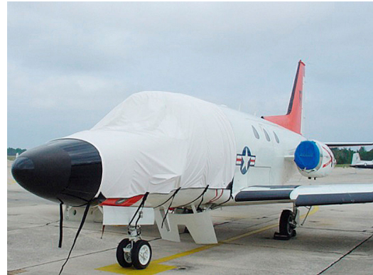
Sabre 40 Cockpit and Engine Covers set